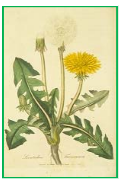
A weed is a plant growing where you don't want it!

Dandelion was introduced to the United States by colonists in the mid-1600's as a food and for medicinal purposes. It has since escaped and "naturalized" throughout the US. Depending upon your perspective it is a weed, a naturalized species, or native since the mid-1600's