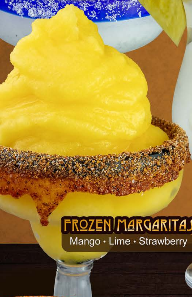
FROZEN MARGARITAS Mango • Lime • Strawberry