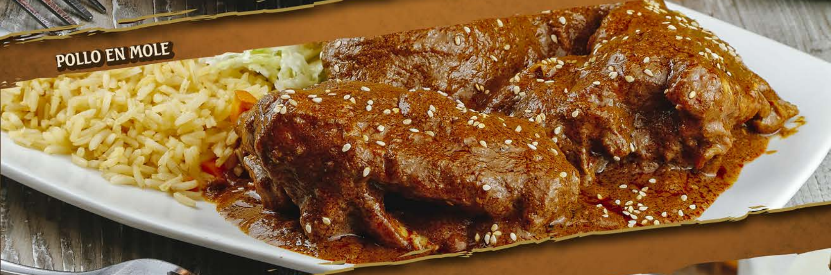
POLLO EN MOLE