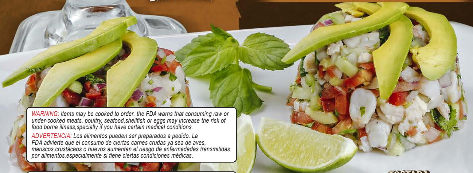
TOSTADA DE CEVICHE

WARNING: items may be cooked to order. the FDA warns that consuming raw or under-cooked meats, poultry, seafood, shellfish or eggs may increase the risk of food borne illness, specially if you have certain medical conditions.