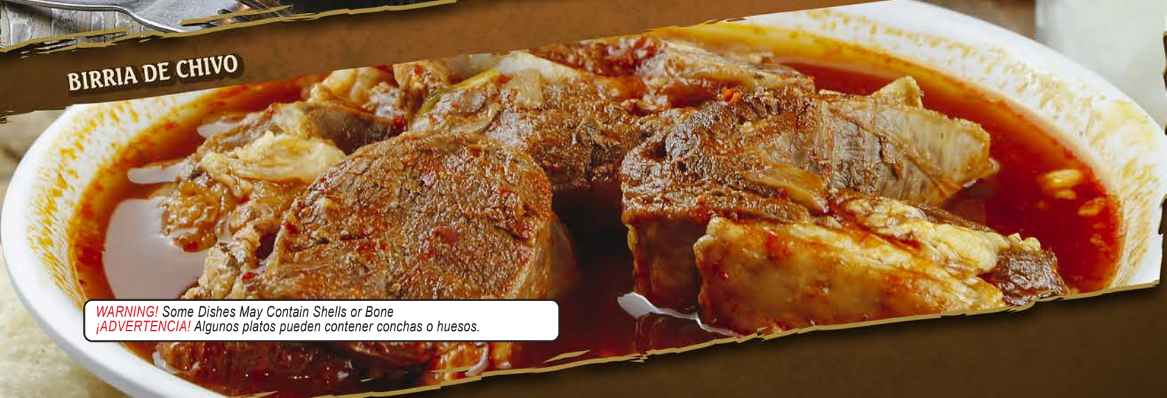
BIRRIA DE CHIVO

WARNING! Some Dishes May Contain Shells or Bone ¡ADVERTENCIA! Algunos platos pueden contener conchas o huesos.