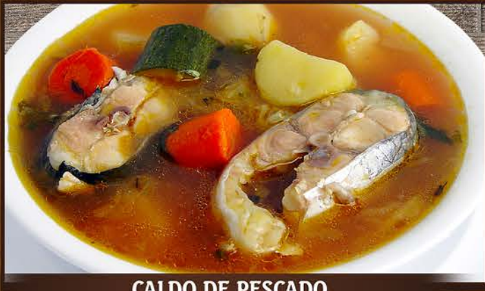
CALDO DE PESCADO