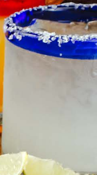
MARGARITAS ON THE ROCKS

Mango • Lime • Strawberry • Jalapeño Cucumber