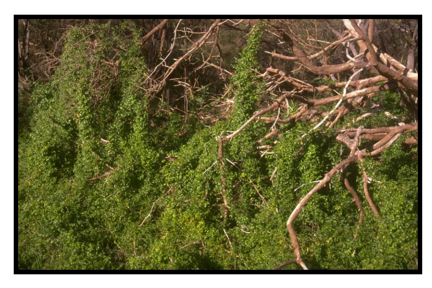
Bridal creeper is one of the worst environmental weeds in southern Australia, posing a serious threat to our biodiversity.