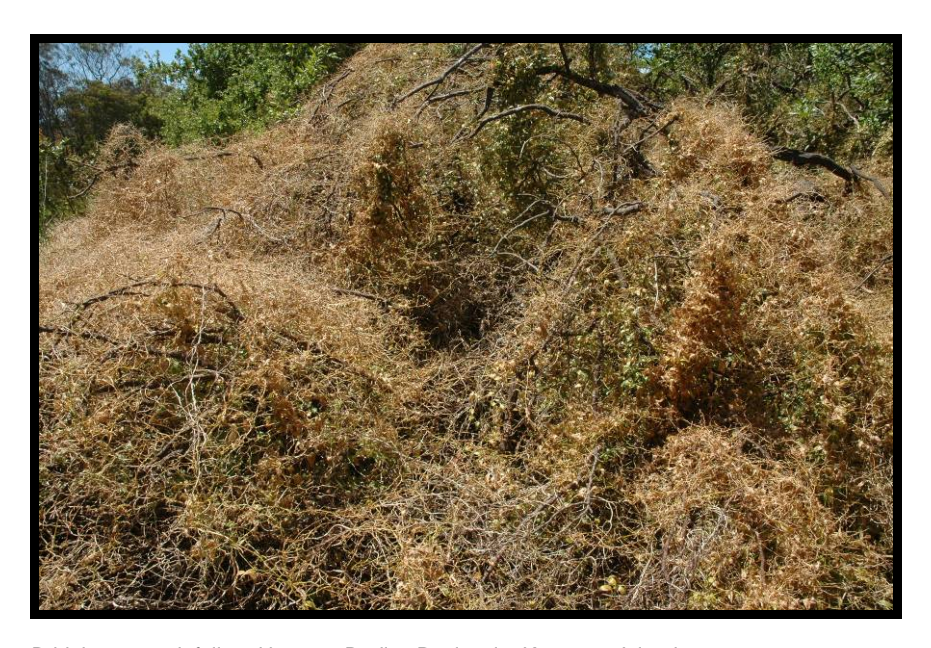
Bridal creeper defoliated by rust, Dudley Peninsula, Kangaroo Island