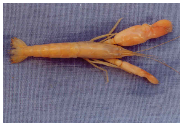
Figure 11: Alpheus lobidens Length, 45mm