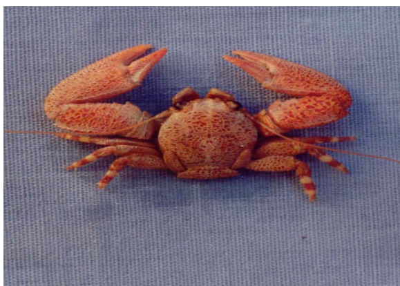
Figure 10: Petrolisthes rufescens Length, 22mm