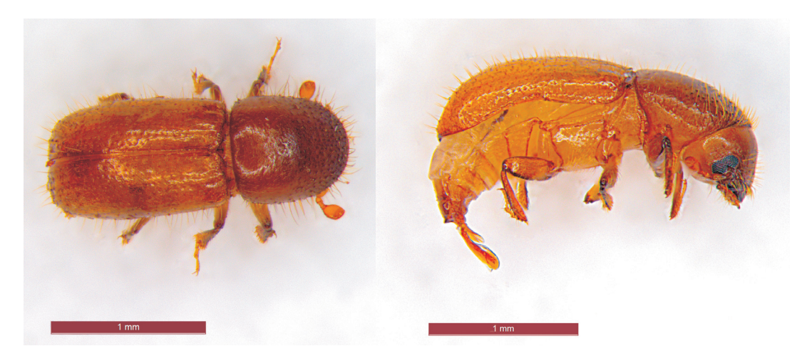
FIGURE 7. The male of Xyleborinus attenuatus (Blandford, 1894).