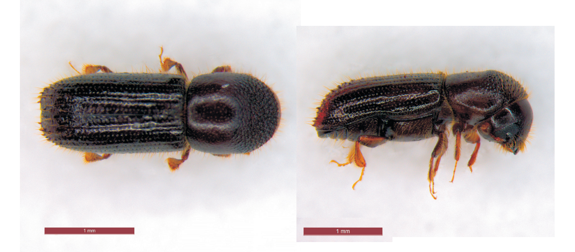
FIGURE 8. The female of Xyleborinus attenuatus (Blandford, 1894).

before they start dispersal flight. The result is that one female might be enough to establish a new population. Males usually stay in the breeding cave all life, but are sometimes observed walking on the surface of the host trees (e. g. Ericson 2008). While females are good flyers, males have reduced and not functional flying wings (Hamilton 1967 cf. Kirkendall 1993).