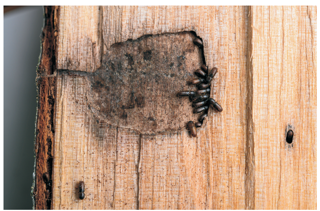
FIGURE 5. The breeding gallery/cave of Xyleborinus attenuatus (Blandford, 1894) in Alnus incana . The cave has only one entrance. This gallery contained about 50 specimens. All except three were females.