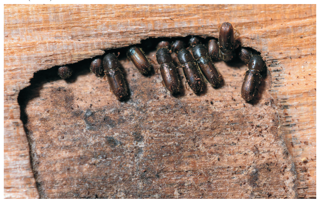
FIGURE 6. A close up of the cave with sisters of Xyleborinus attenuatus (Blandford, 1894).