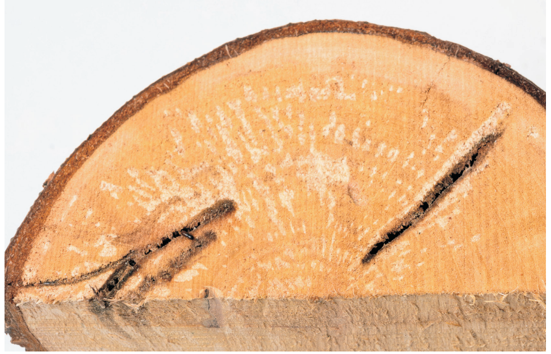
FIGURE 4. Breeding galleries of Xyleborinus attenuatus (Blandford, 1894) seen on a cross section of Alnus incana .