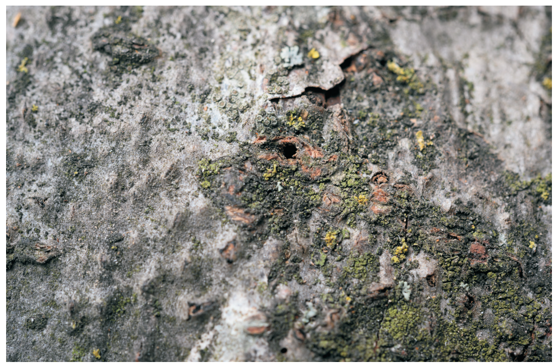
FIGURE 3. An entrance hole to a breeding gallery of Xyleborinus attenuatus (Blandford, 1894) in Alnus incana .