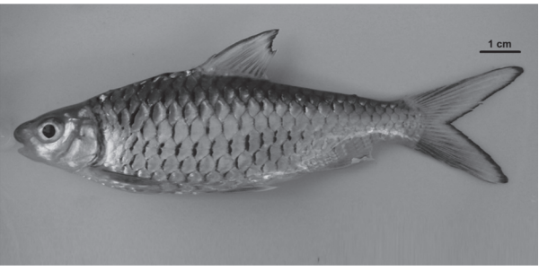
Fig. 3. Specimen of Mystacoleucus marginatus caught on 2 June 2019 from the Karangkates reservoir, East Java province.

Several specimens collected on East Java were identified as Mystacoleucus marginatus (Fig. 3). Detailed morphological characters are as follows: Body compressed, dorsal profile ascending and slightly convex. Snout and upper part of head provided with pores, diminishing in size backwards. Posteriorbarbels at corner of mouth shorter than eye. Dorsal slightly emarginate, fourth spinewith its flexible portion not much longer than head, strongly serrated behind. Ventralssubequal to pectorals, their hind bordersquare, not reaching anal. Axillary scale of ventrals muchdeveloped. Pectorals nearly equal to head. Anal truncate. Caudal deeply forked, the lobes pointed, much longer than head. Body silvery, upper surface brownish, base of scales with a semi-