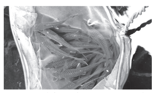
Fig. 2. Live Stockof Mystacoleucus marginatus captured on 2 June-14 July 2019 in Brantas basin, East Java.

ited at the Ichthyology Laboratory, Brawijaya University, Malang, Indonesa (IL.Mm.VI. 2019). The remaining twenty two (22) were kept as livestock at the Fish Reproduction Laboratory, Brawijaya University, Malang Indonesia (Fig. 2). The live individuals were transported in plastic bags with oxygen (Piper et al. , 1982).