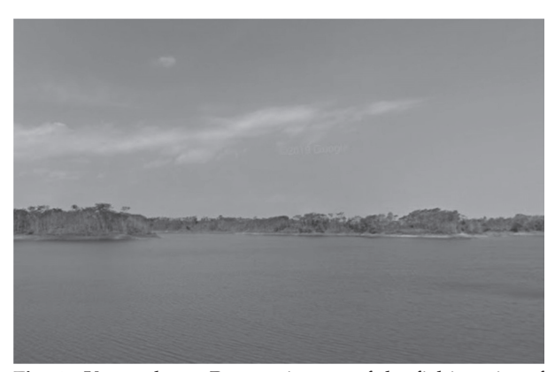
Fig. 1. Karangkates Reservoir, one of the fishing site of Mystacoleucus marginatus in the Brantas basin, East Java.

We conducted a random sampling survey of the fish diversity in the Karangkates and Wlingi reservoir in Blitar regency, Brantas river in Kediri regency, Rolak Songo dam in Mojokerto regency, Porong river site 1 and 2 in Sidoarjo regency and Mas river in Surabaya city. All sampling sites are located in East Java province, Indonesia (Fig. 1). Specimens of M. marginatus were obtained from a local fishermen during a fieldwork carried out on 2 June-14 July, 2019. We collected specimens using cast-nets. We also obtained specimnes from local fishermen, who used traditional fish traps.