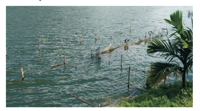
Fig. 1. Maninjau Lake, the location where Esomus metallicus was collected.

cast net and fish trap on 26-28 October 2019 in a part of lakeside (0°18′14″S; 100°13′31″E). Administratively, the site is located in Agam Regency, West Sumatra province, Indonesia (Fiure 1).