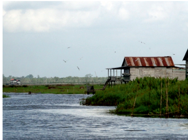
Fig. 2. Jeruju River with vegetation and house of local people on 30 August 2020.

This study was conducted at Jeruju River (03°33'12"S, 105°37'06"E). Jeruju River is administratively located at Jeruju Village, Cengal Subdistrict, Ogan Komering Ilir District, South Sumatra Province (Figure 1). The Jeruju village is located at the edge of the Jeruju River, and c. 15 km inland (Figure 2). The habitat is a peat swamp area, with 4 pH. We visit Jeruju Village on 28-30 August 2020, coincidentally during the dry season in Sumatra. This area can be accessed by car from Palembang (the capital city of South Sumatra Province) or Kayu Agung (the capital city of Ogan Komering Ilir). The Jeruju Village is one village facilitated by Peat Restoration Agency or Badan Restorasi Gambut, for a community development program to improve local people livelihoods (Badan Restorasi Gambut 2018). As a peat swamp area, vegetation in this area is dominated by Meulaleuca sp, Hymenachine amplexicaulis