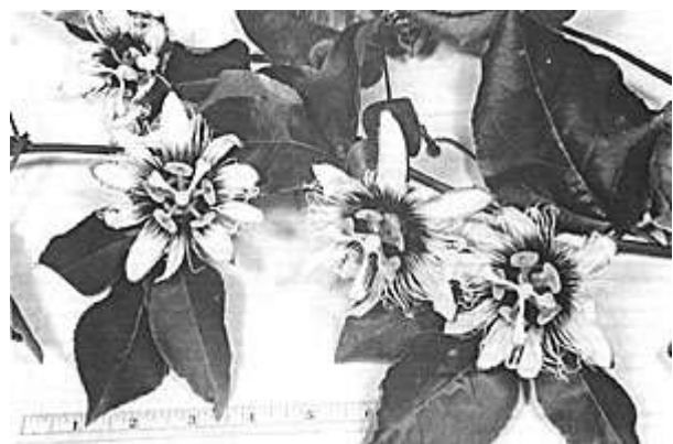
Fig. 92: Flowers of the purple passionfruit are fragrant and lovely, though those of the yellow are richer in color.

Yellow passionfruit flowers are perfect but self-sterile. In controlled pollination studies at the College of Agriculture of Jaboticabal, Sao Paulo, Brazil, it was found that the yellow passionfruit has three types of flowers according to the curvature of the style: TC (totally curved), PC (partially curved), and SC (upright-styled). TC flowers are most prevalent. Carpenter bees ( Xylocopa megaxylocopa frontalis and X. neoxylocopa ) efficiently pollinated TC and PC flowers. Honey bees ( Apis mellifera adansonii ) were much less efficient. Wind is ineffective because of the heaviness and stickiness of the pollen.