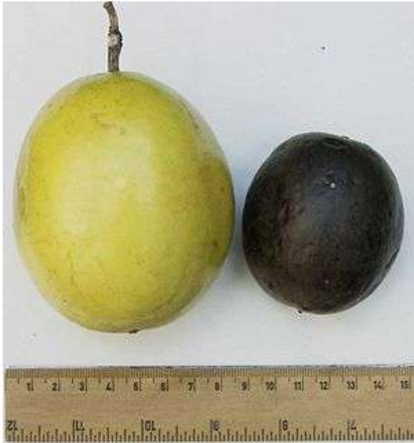
Früchte von Passiflora edulis , links forma flavicarpa , rechts f. edulis