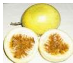
P. edulis f. flavicarpa : Frucht geschlossen und