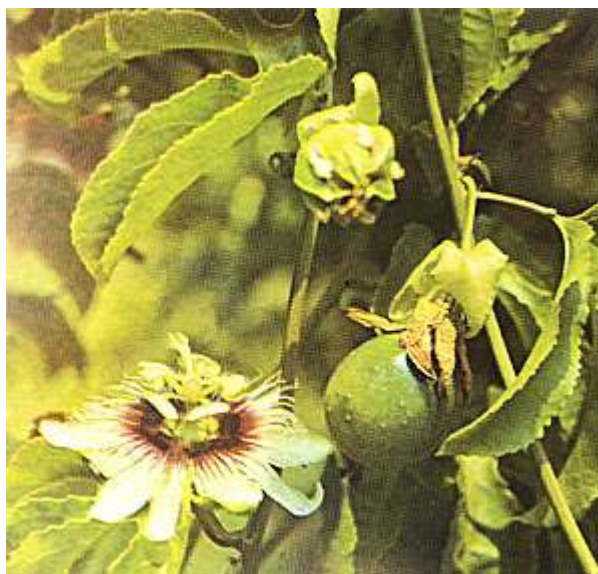
Plate XLIII: YELLOW PASSIONFRUIT, Passiflora edulis var. flavicarpa

Passionfruit vines are usually grown from seeds. With the yellow form, seedling variation provides cross-pollination and helps overcome the problem of self-sterility. Some say that the fruits should be stored for a week or two to allow them to shrivel and become perfectly ripe before seeds are extracted. If planted soon after removal from the fruit, seeds will germinate in 2 to 3 weeks. Cleaned and stored seeds have a lower and slower rate of germination. Sprouting may be hastened by allowing the pulp to ferment for a few days before separating the seeds, or by chipping the seeds or rubbing them with fine sandpaper. Soaking, often recommended, has not proved helpful. Seeds are planted 1/2 in (1.25 cm) deep in beds, and seedlings may be transplanted when 10 in (25 cm) high. If taller—up to 3 ft (.9 in)—the tops should be cut back and the plants heavily watered.