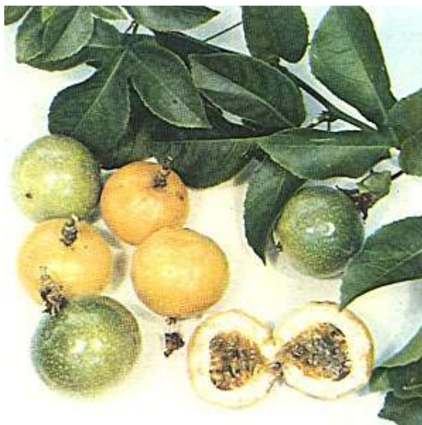
Plate XLIV: YELLOW PASSIONFRUIT, Passiflora edulis var. flavicarpa

The different flowering seasons of the purple and yellow passionfruits have been mentioned under "Pollination". In some areas, as in India, the vines bear throughout the year but peak periods are, first, August to December, and, second, March to May. At the latter time, the fruits are somewhat smaller, with less juice. In Hawaii, passionfruits mature from June through January, with heaviest crops in July and August and October and November. With variations according to cultivar, and with commercial cultivation both above and below the Equator, there need never be a shortage of raw material for processing.