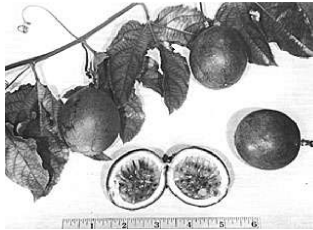
Fig. 91: Purple passionfruit ( Passiflora edulis ) is subtropical, important in some countries, while the more tropical yellow passionfruit excels in others. Both yield delicious juice.

The passionfruit vine is a shallow-rooted, woody, perennial, climbing by means of tendrils. The alternate, evergreen leaves, deeply 3-lobed when mature, are finely toothed, 3 to 8 in (7.5-20 cm) long, deep-green and glossy above, paler and dull beneath, and, like the young stems and tendrils, tinged with red or purple, especially in the yellow form. A single, fragrant flower, 2 to 3 in (5-7.5 cm) wide, is borne at each node on the new growth. The bloom, clasped by 3 large, green, leaflike bracts, consists of 5 greenish-white sepals, 5 white petals, a fringelike corona of straight, white-tipped rays, rich purple at the base, also 5 stamens with large anthers, the ovary, and triple-branched style forming a prominent central structure. The flower of the yellow is the more showy, with more intense color. The nearly round or ovoid fruit, 1 1/2 to 3 in (4-7.5 cm) wide, has a tough rind, smooth, waxy, ranging in hue from dark-purple with faint, fine white specks, to light-yellow or pumpkin-color. It is 1/8 in (3 mm) thick, adhering to a 1/4 in (6 mm) layer of white pith. Within is a cavity more or less filled with an aromatic mass of double-walled, membranous sacs filled with orange-colored, pulpy juice and as many as 250 small, hard, dark-brown or black, pitted seeds. The flavor is appealing, musky, guava-like, subacid to acid.