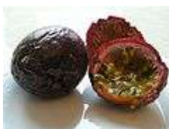
P. edulis f. edulis : Frucht geschlossen und

Neben anderen Passifloraceen werden in Südamerika auch die Blätter von Passiflora edulis als harntreibendes Mittel, bei Entzündungen oder Beruhigungsmittel bei Asthma verwendet. Das in Passionsblumen-Präparaten zu Beruhigungszwecken oder als schlafförderndes Mittel enthaltene Passiflorin wurde auch in Blättern von Passiflora edulis nachgewiesen (gängige erhältliche Präparate basieren allerdings weitestgehend auf Passiflora incarnata ).