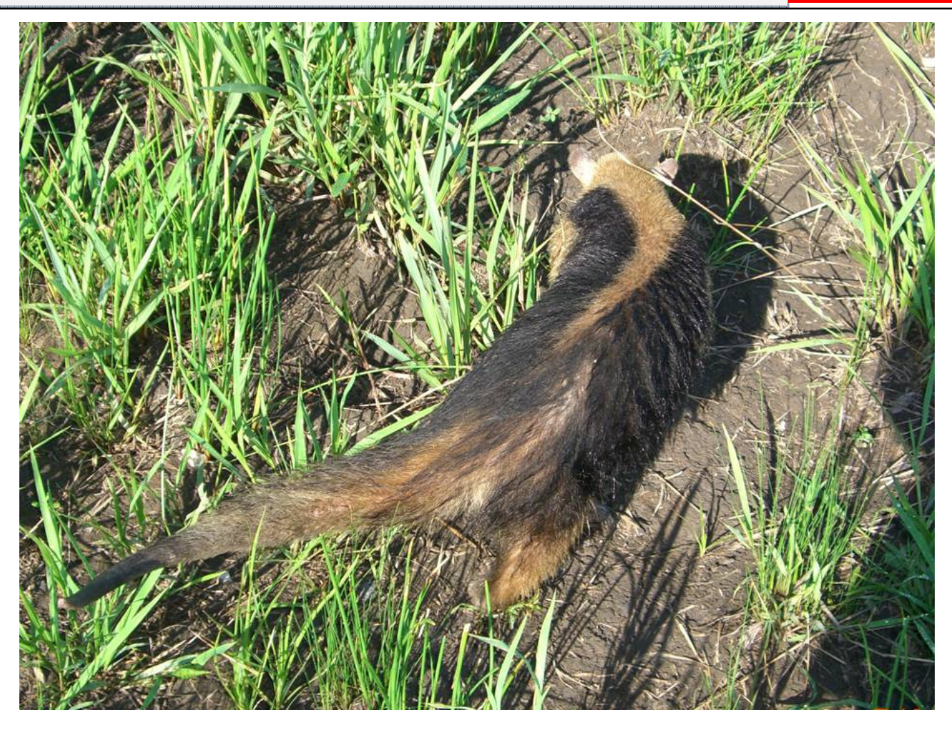
FIGURE 7- (FPMAM39PH) Southern Tamandua Tamandua tetradactyla . Adult dorsal. Departamento Concepción, December 2007.