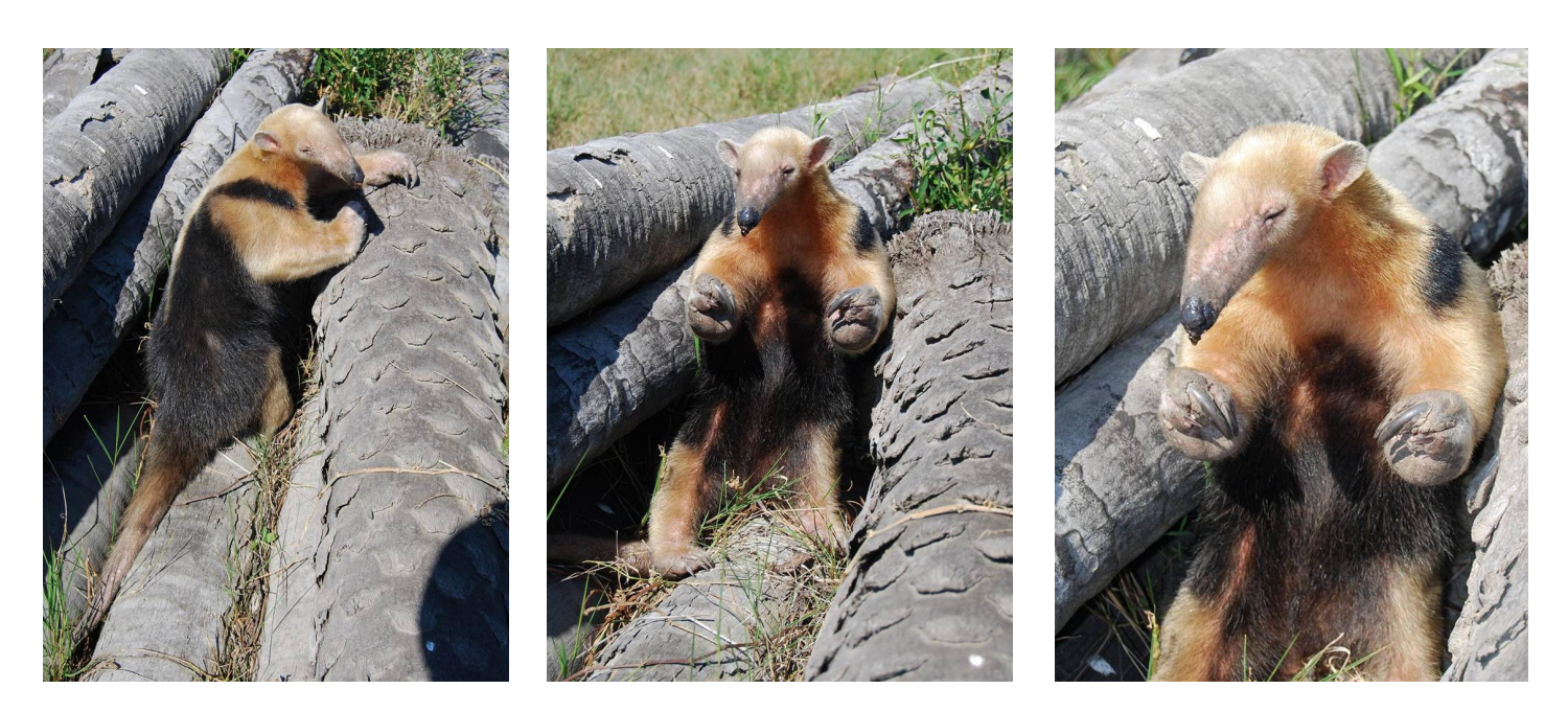
FIGURE 2 - (FPMAM908PH) Southern Tamandua Tamandua tetradactyla . Photo Arne Lesterhuis. Adult lateral. Departamento Presidente Hayes, 2010.

FIGURE 3 - (FPMAM907PH) Southern Tamandua Tamandua tetradactyla . Photo Arne Lesterhuis. Adult in defensive posture. Departamento Presidente Hayes, 2010.