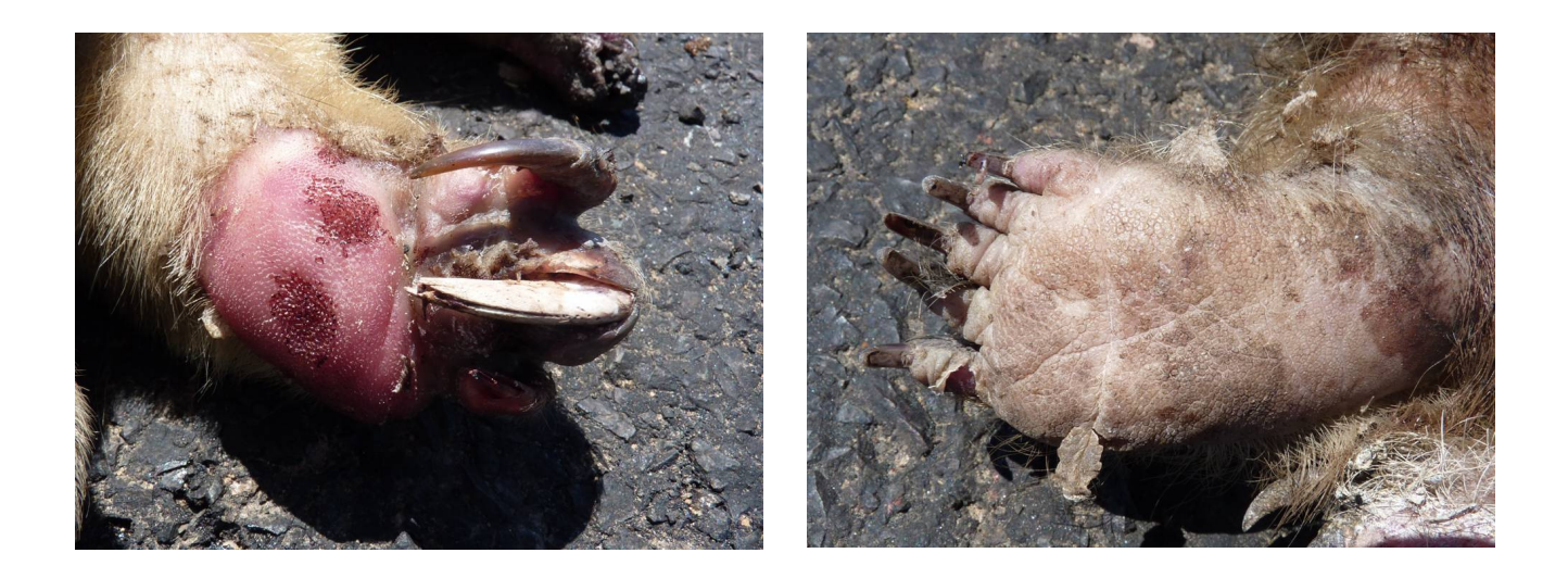
FIGURE 5 - (FPMAM903PH) Southern Tamandua Tamandua tetradactyla. Forefoot of roadkill. Ruta Trans-Chaco km250, Departamento Presidente Hayes, November 2010. FIGURE 6 - (FPMAM904PH) Southern Tamandua Tamandua tetradactyla. Hind foot of roadkill. Ruta Trans-Chaco km250, Departamento Presidente Hayes, November 2010.

FIGURE 4 - (FPMAM906PH) Southern Tamandua Tamandua tetradactyla. Adult in defensive posture. Departamento Presidente Hayes, 2010.