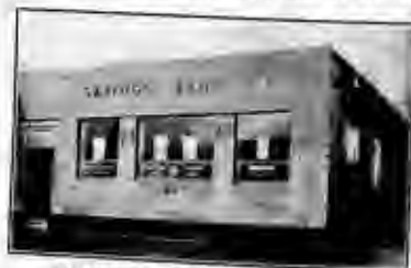
FALKIRK'S NEW PREMISES AT WHITBURN

We reproduce below a photograph of the new premises of the Falkirk Savings Bank at Whitburn