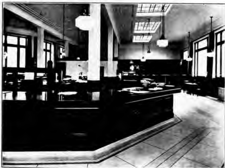
INTERIOR OF THE SAVINGS BANK OF GLASGOW'S NEW PREMISES AT HILLHEAD