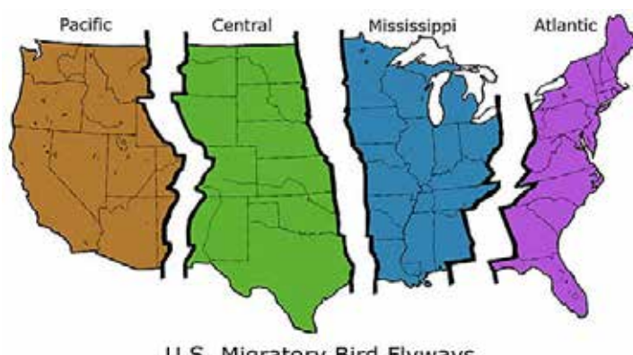
U.S. Migratory Bird Flyways

"We don't really change our practice. We're very cautious," he said. "We wear separate shoes inside the houses. We're constantly monitoring what we're doing and making sure