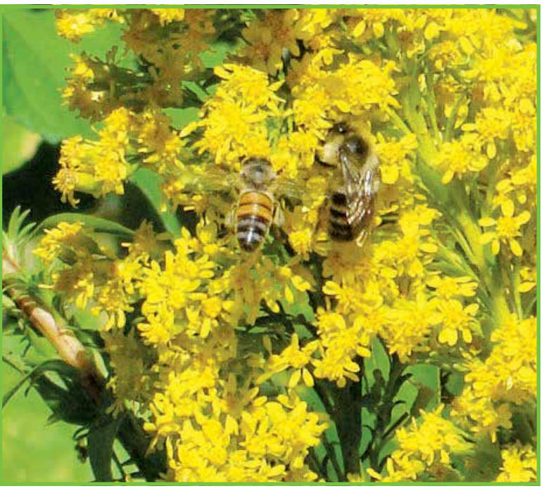
There are many species of goldenrods native to Georgia. Contrary to popular belief, they do not cause hay fever. They are favorites of native bees such as bumblebees and honeybees, as well as butterflies.

and rhododendrons, blackberries, clethra, rosemary, Cumberland rosemary ( Conradina verticillata ) and gray-leaved conradina ( Conradina canescens ).