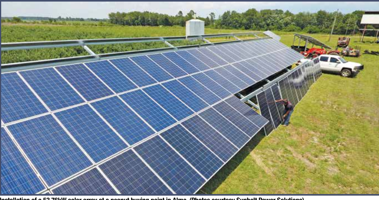
Installation of a 53.76kW solar array at a peanut buying point in Alma.

By offering an alternative to traditional roof or groundmount solar systems, Sunbelt Power Solutions has lowered the cost to $2.20 per watt or less, depending upon the size of the system. According to the company, its ground units