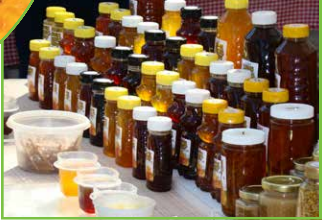
A sampling of honeys from Hidden Springs Farm in Williamson.

Select single-flowered varieties instead of doubleflowered ones in order to help bees. At left, an American bumblebee takes advantage of a singleflowered zinnia.