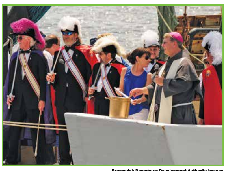
Brunswick Downtown Development Authority images