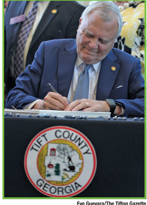
Gov. Nathan Deal signs legislation in Tifton May 2.

HB 951 also provides for the creation of See HB-951 , page 6