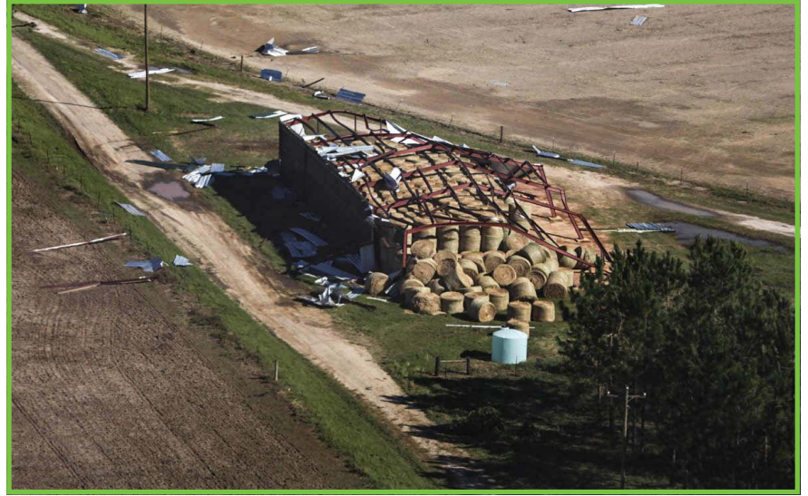
Damage from Hurricane Michael in Southwest Georgia.

The State House and Senate Appropriations committees have both voted to add millions more to the fund through pro-