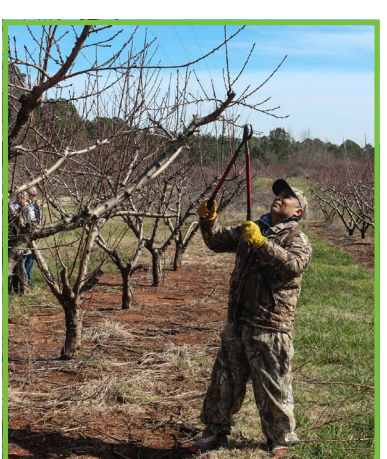
Pruning peach trees While Georgia Grown was visiting Dickey Farms, a field worker was busy pruning the peach trees in anticipation of a new crop.