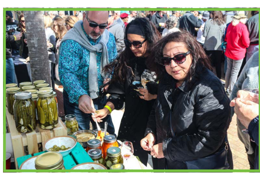
Pickled everything Crowds were drawn to the tent occupied by Phickles out of Athens. They sold out of pickled Brussels Sprouts, the newest addition to the