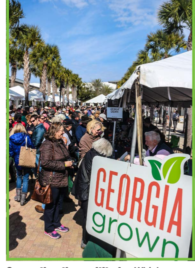
Converting the multitudes Whiskey, Wine and Wildlife - an annual fundraiser for the Jekyll Island Foundation - offers Georgia Grown members an audience with affluent coastal consumers.