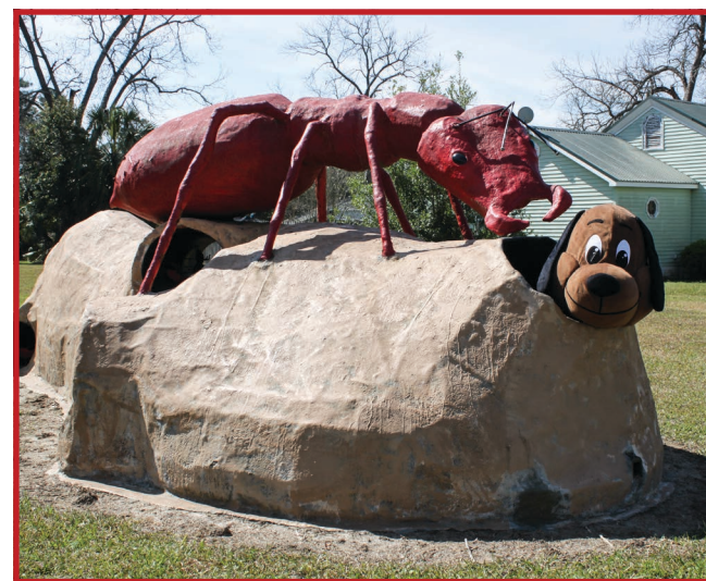
Georgie the Georgia Grown Mascot plays hide-and-seek in a fire ant mound at the annual Fire Ant Festival in Ashburn.