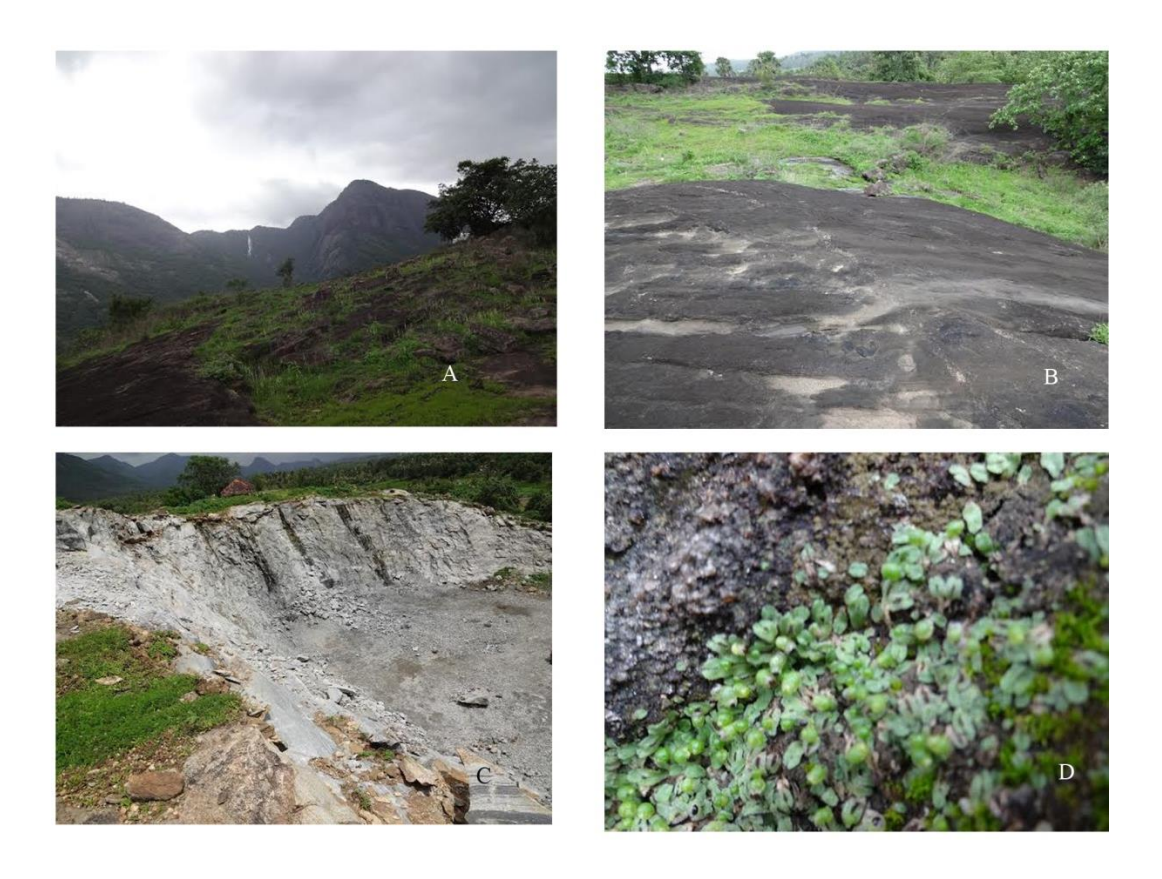
Fig. 1. Exormotheca ceylonensis, A. Vengapara, the habitat. B. the rocky patch from where the plant was located in 2012, C. the left over of the hill after heavy mining in 2014, D. a small patch of E. ceylonensis left in 2014.

UDAR, R., CHANDRA, V. (1964). Exormotheca ceylonensis - New record from India, Current Science 33: 436–438.