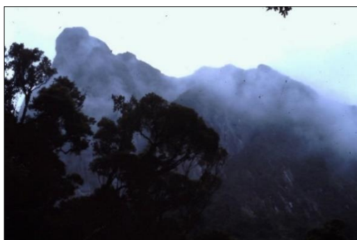
Fig.1: Morning clouds on Marojejy massif

aspects from var. dicnemioides , therefore it seemed to be necessary to distinguish it at the subspecies level, being allopatric and morphologically quite different.