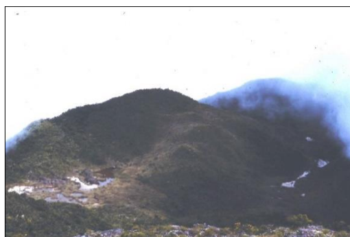
Fig.2: Tarns on plateau behind the summit