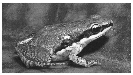
Fig. 3. Female paratype (ZSM 600/2001) of Mantidactylus madinika.

Paratypes.—MRSN A2066 and ZSM 600/2001 (Fig. 3), two adult females, same locality and collecting data as holotype; ZFMK 76103 and ZSM 603/2001–607/2001, five adult males and