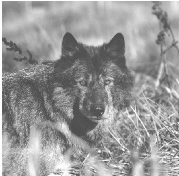
Gray wolf, courtesy Wolf Education Research Center

The rule remains in effect only until the administration removes wolves from the list of endangered species, an action that is expected to come next month. Nonetheless, the U.S. Fish and Wildlife Service adopted the rule in response to the state of Wyoming, which insisted