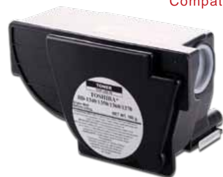
TT1350 Compatible with T-1350