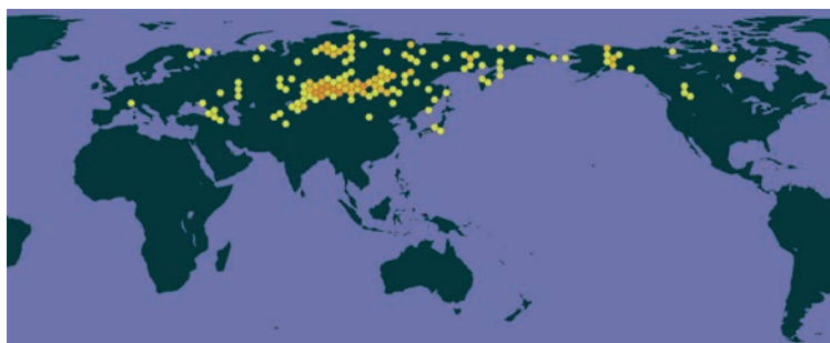
Figure 2. Distribution map of Hedysarum specimens deposited at NS and NSK herbaria