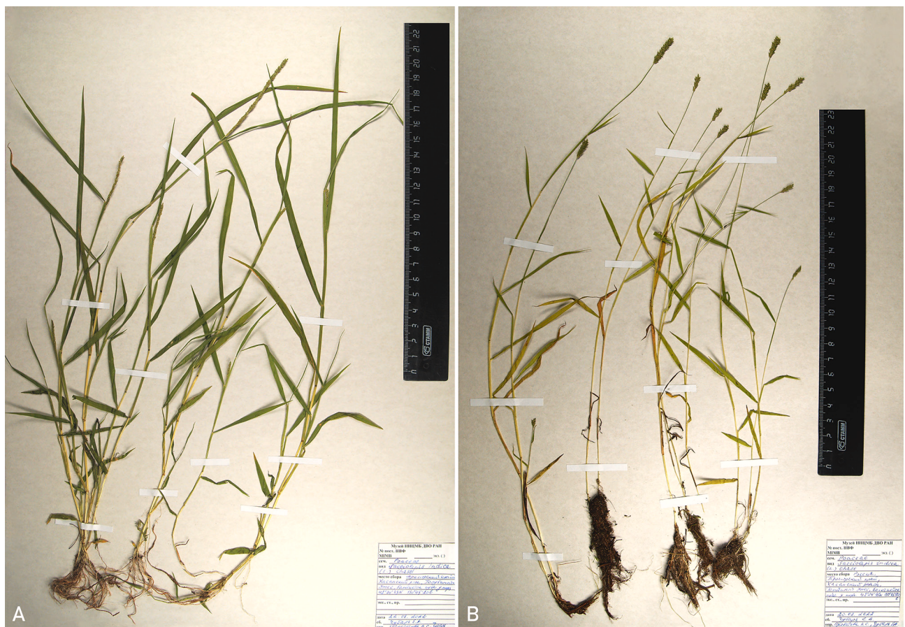
Figure 1 Samples of Sacciolepis indica (L.) Chase from the Tumen River valley (Russia), collected on of dune tops (A) and in depressions between dunes in flooded areas (B)

The plants of S. indica from the Primorye Territory show similarities with different specimens of this species