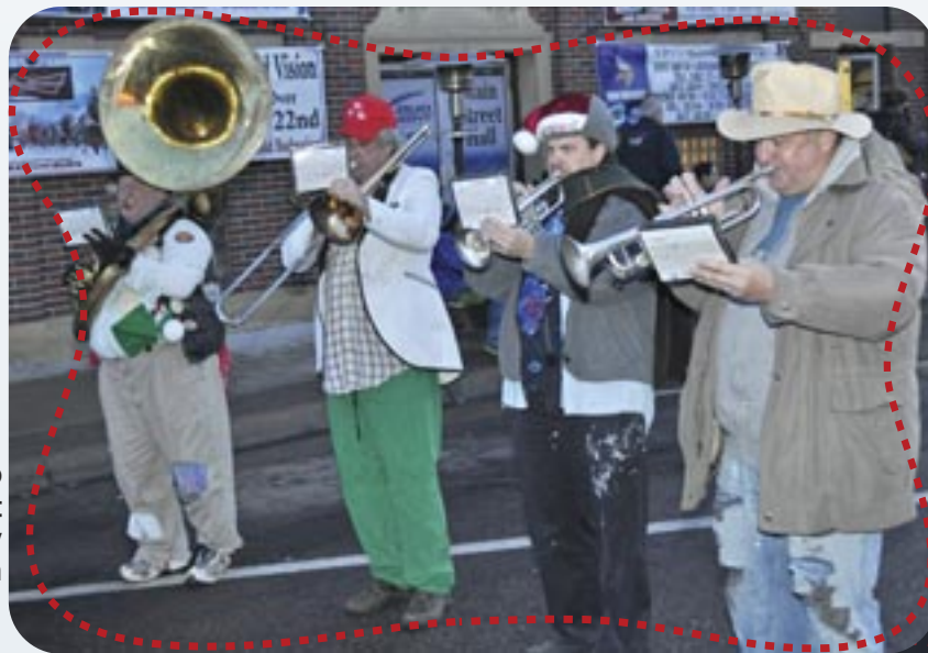
The Shell's Hobo Christmas Quartet provided holiday music on Main Street.