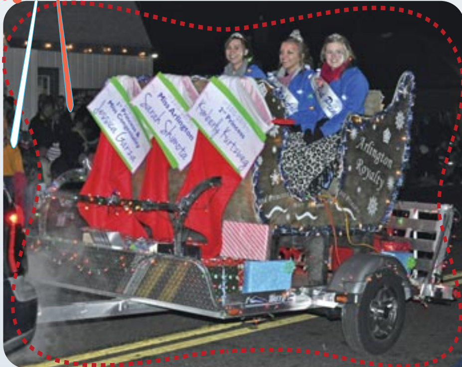
The Arlington Royalty was featured in the Arli-Dazzle Parade.