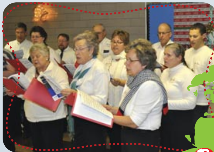
The choir from St. Paul's Lutheran Choir sang Christmas carols during the Bethlehem Express.