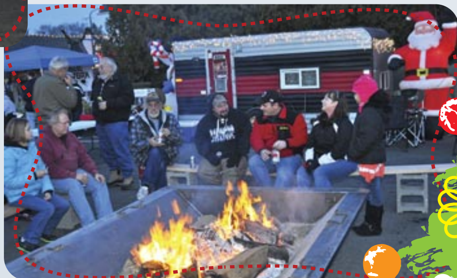
A community bonfire, sponsored by the Arlington Fire Department, was held in the City Parking Lot. Approximately 375 smores were served after the Arli-Dazzle Parade.