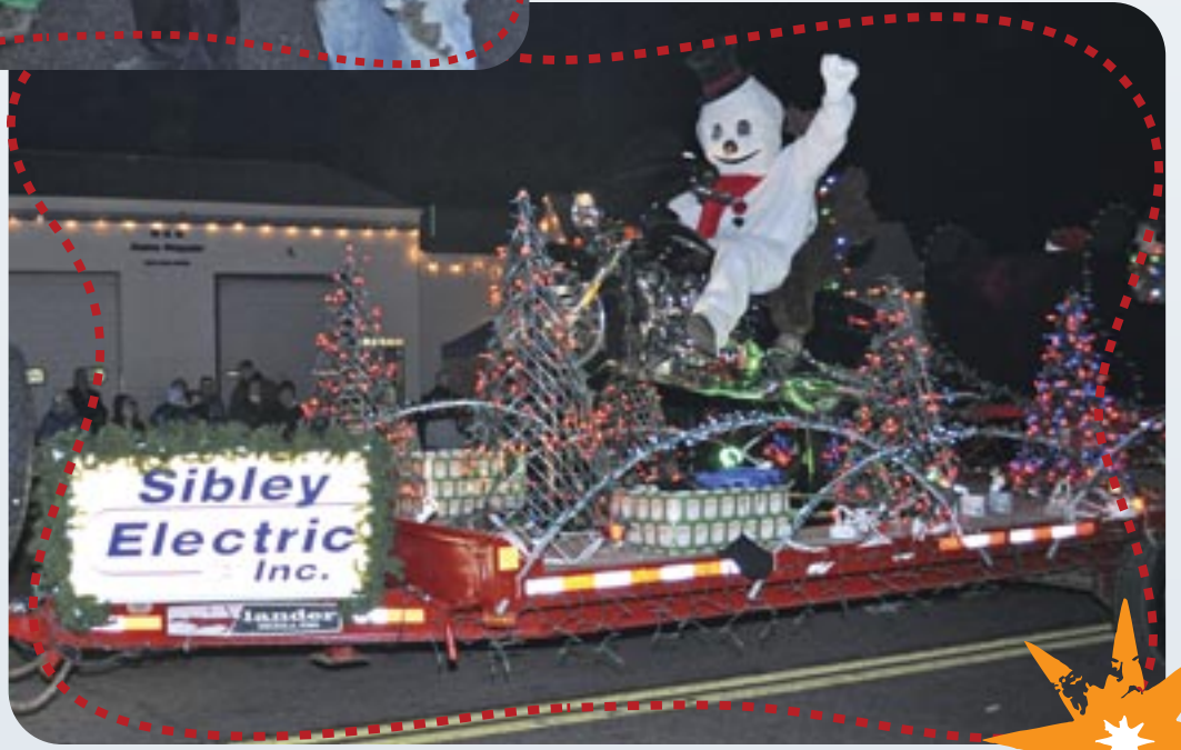
Sibley Electric, Inc. entered a very creative float in the Arli-Dazzle Parade.