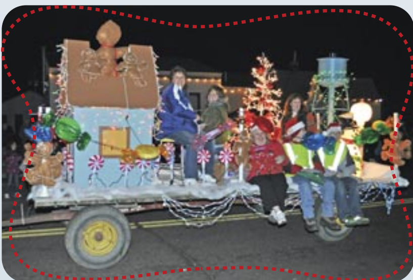
The Arlington-Green Isle High School Class of 1980 entered this float in the Arli-Dazzle Parade.