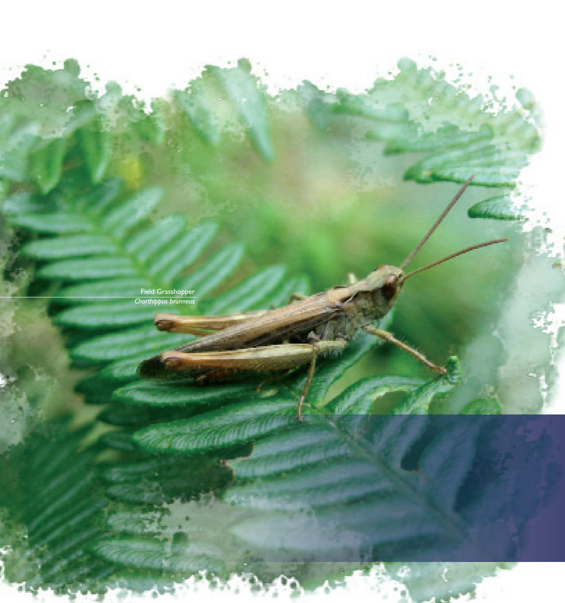
Field Grasshopper Chorthippus brunneus