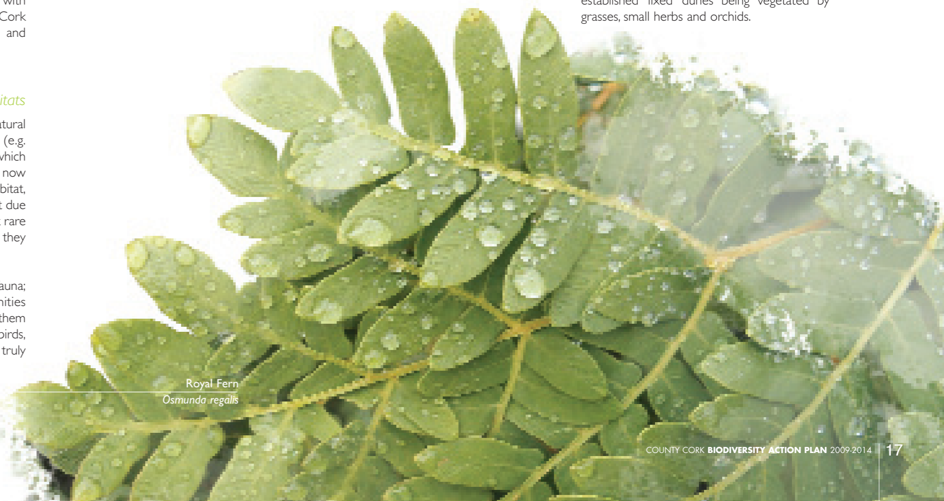
Royal Fern Osmunda regalis

Coastal lagoons, bodies of brackish water, such as Kilkieran Lake in West Cork support specialised and often rare invertebrate species. Sand dune systems such as Clonakilty and Castlefereke, support a unique flora adapted to cope with both dry conditions and salt-laden winds, from a strandline, colonised by Frosted Orache ( Atriplex laciniata ), Sea Sandwort ( Honkenya peploides ) and Sea Rocket ( Cakile maritima ) to the more familiar Marram grass ( Ammophila arenaria ) through to longer-established 'fixed' dunes being vegetated by grasses, small herbs and orchids.