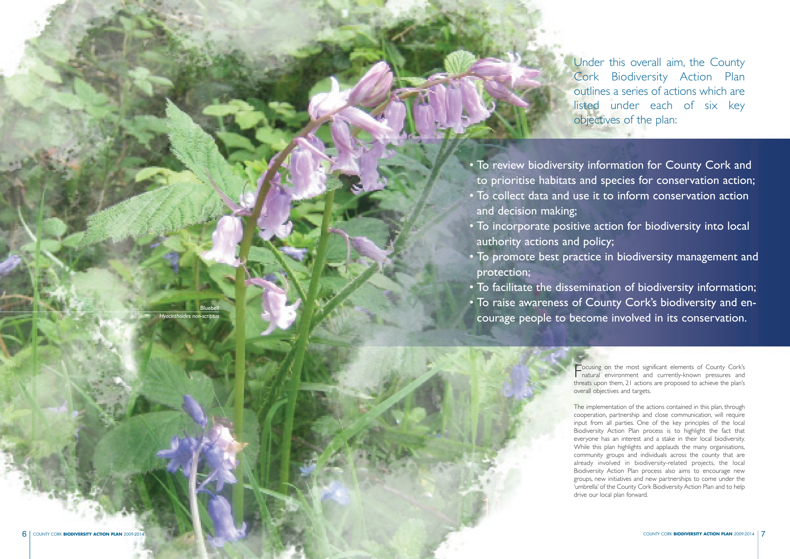
Bluebell Hyacinthoides non-scriptus

Under this overall aim, the County Cork Biodiversity Action Plan outlines a series of actions which are listed under each of six key objectives of the plan: