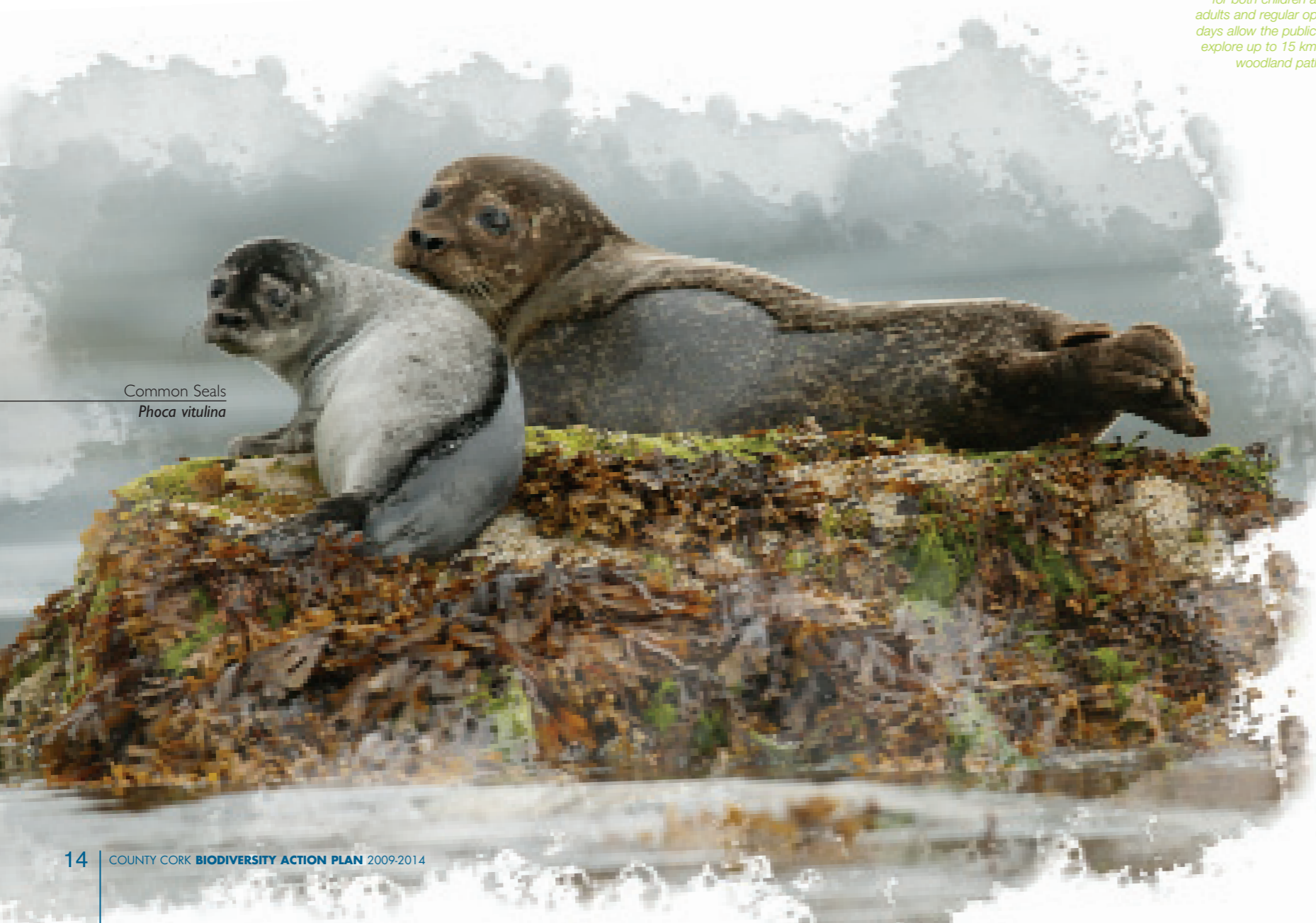
Common Seals Phoca vitulina