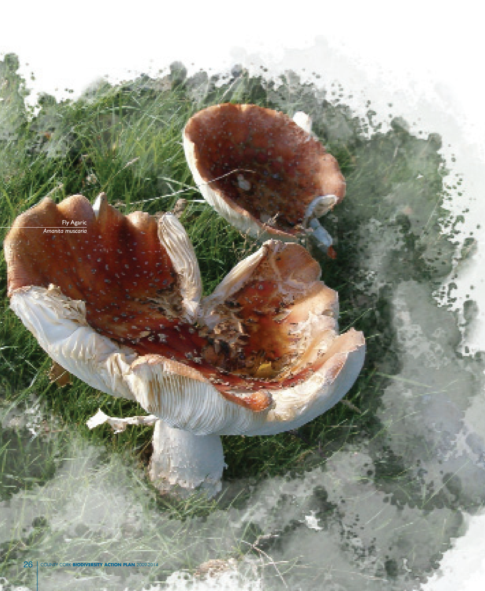
Fly Agaric Amanita muscaria