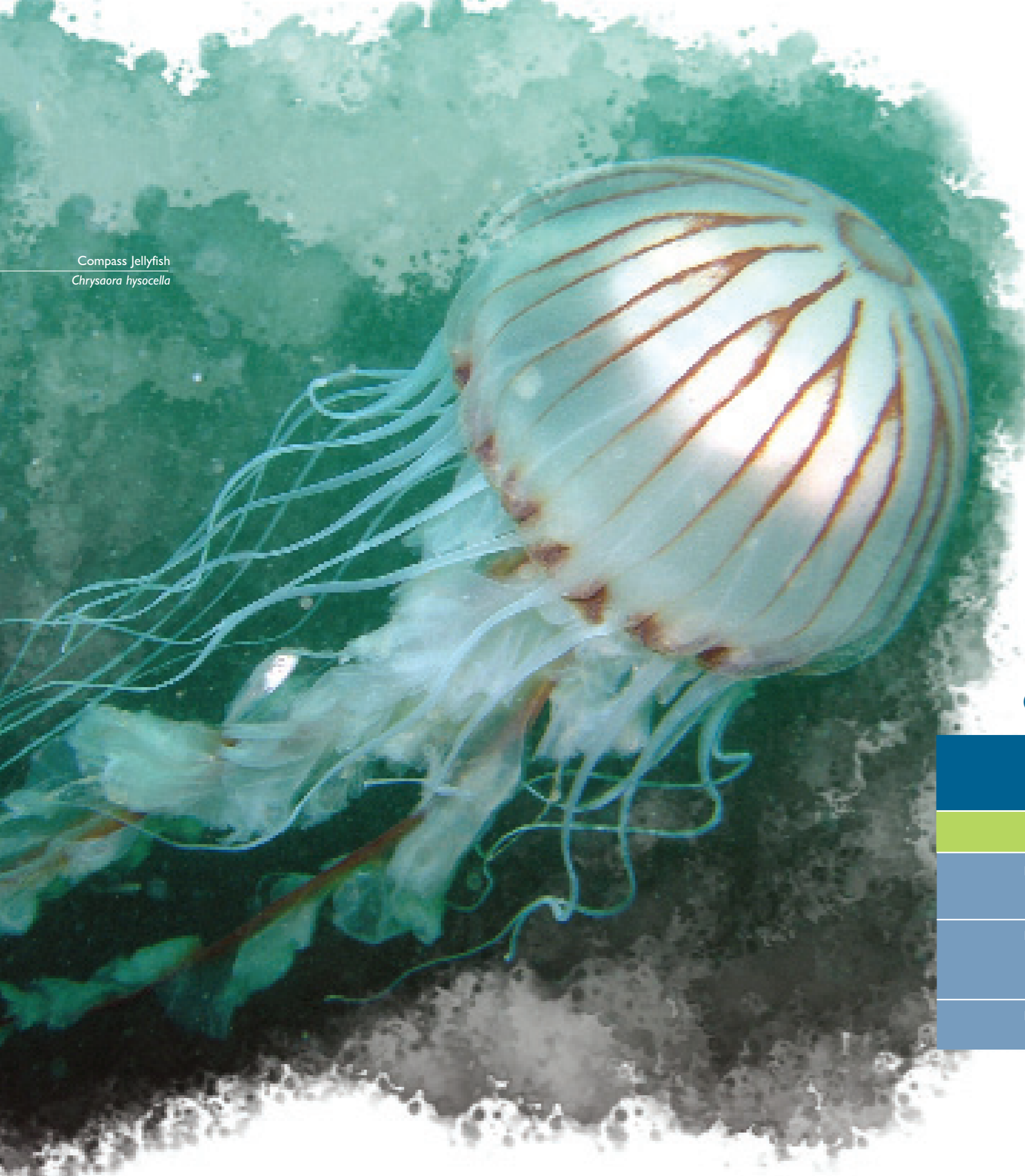
Compass Jellyfish Chrysaora hysocella