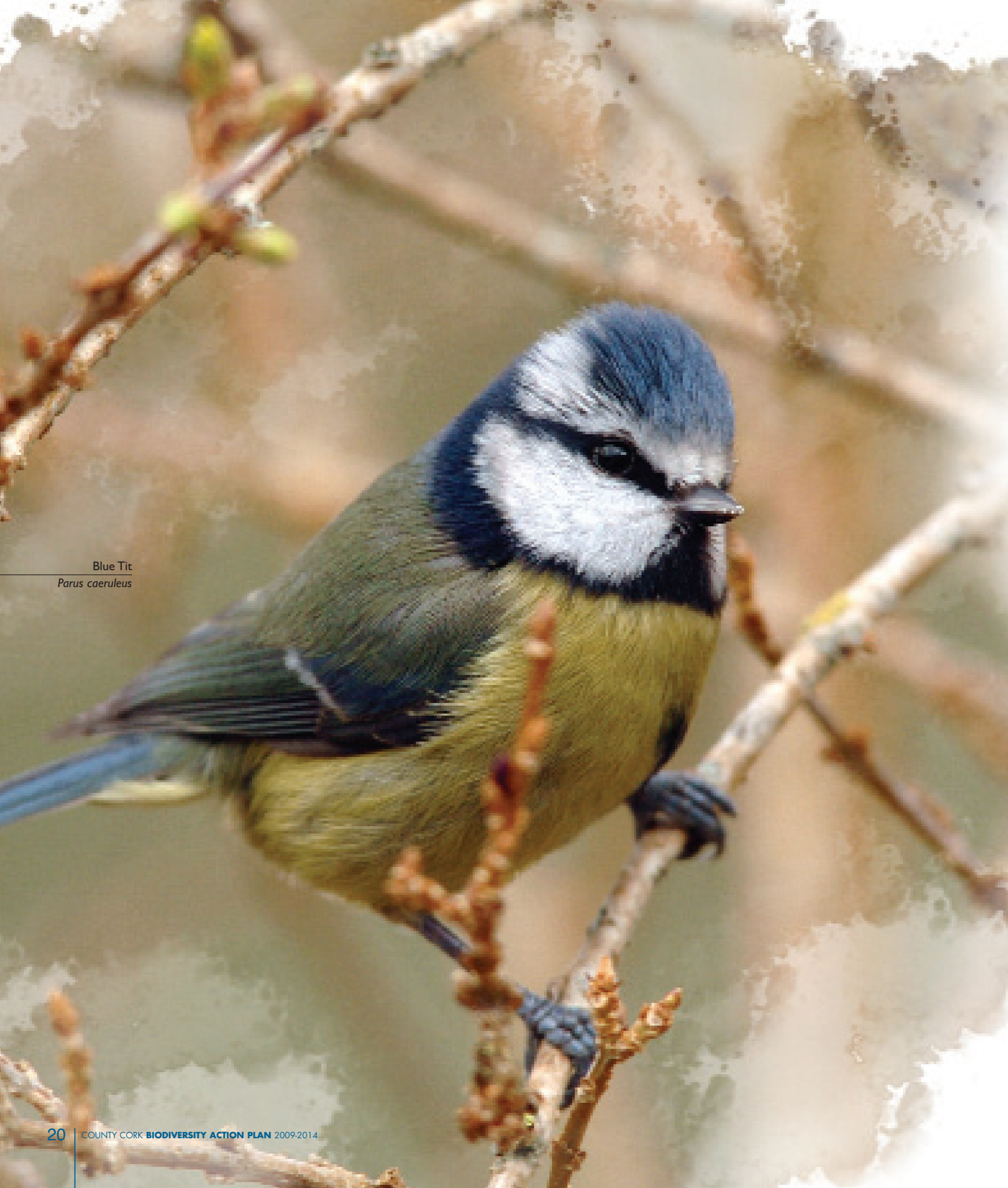
Blue Tit Parus caeruleus