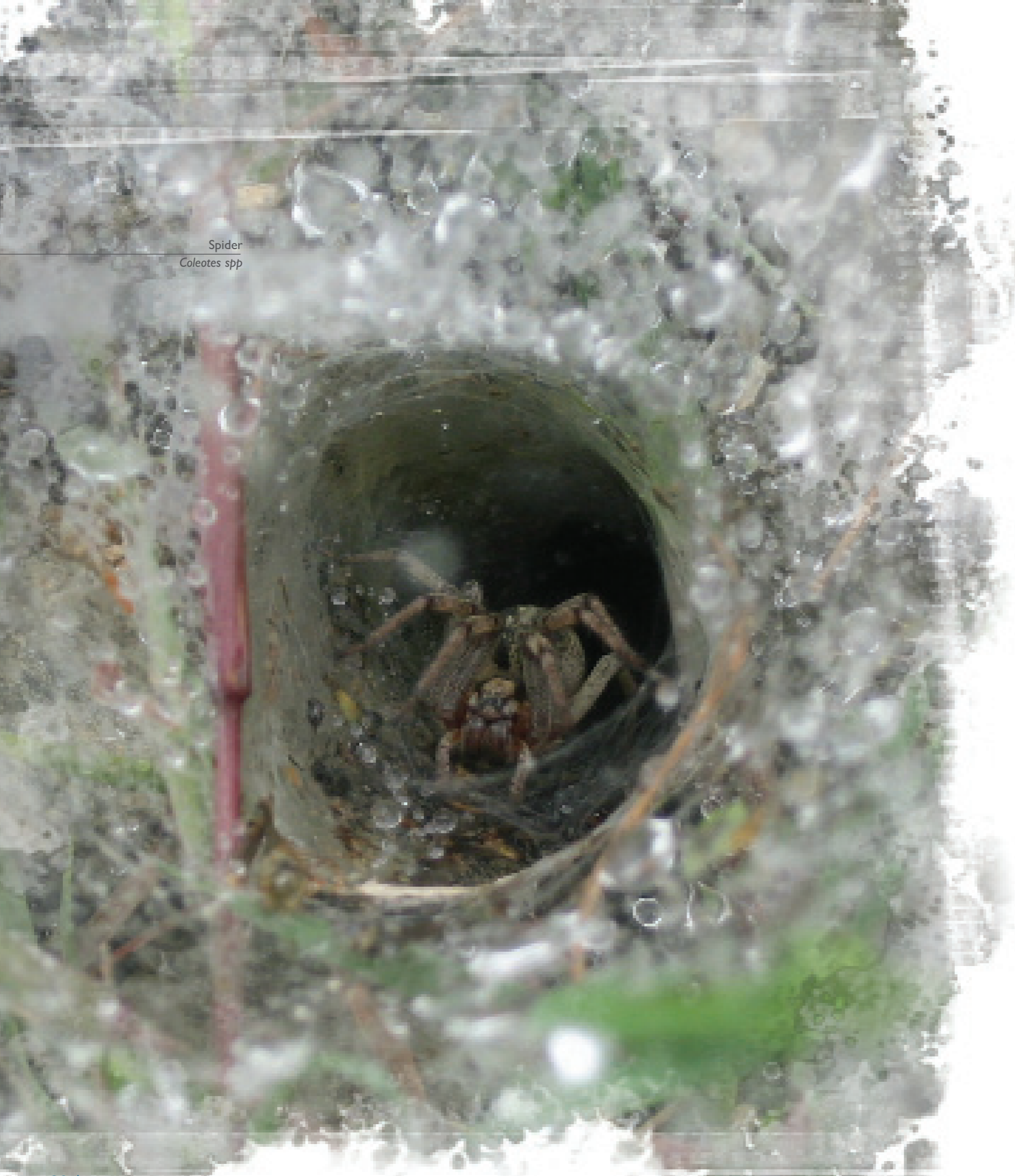
Spider Coleotes spp