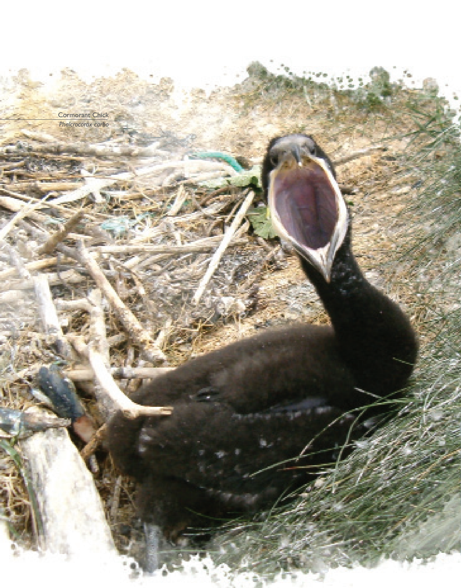
Cormorant Chick Phalacrocorax carbo