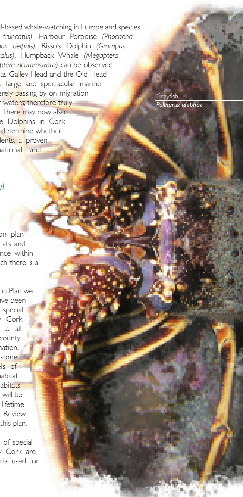
Crayfish Palinurus elephas

The current lists of species and habitats of special conservation significance within County Cork are shown in Appendix 7 as are the criteria used for selecting them.