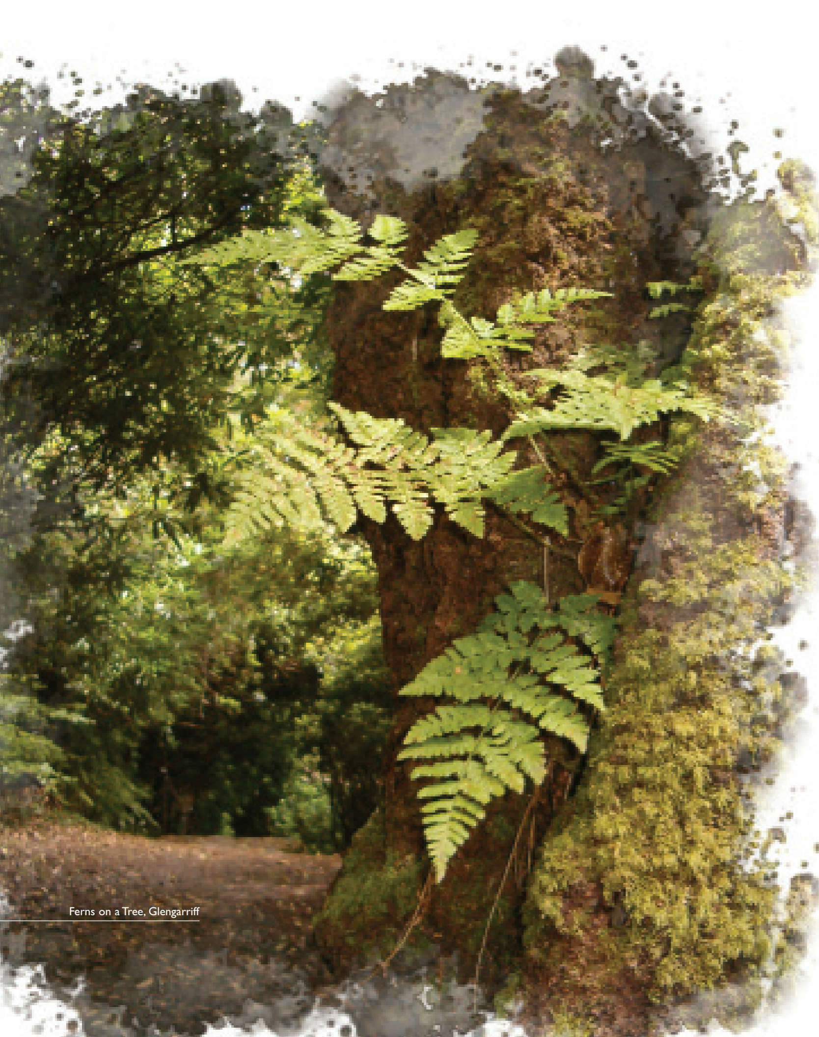
Ferns on a Tree, Glengarriff