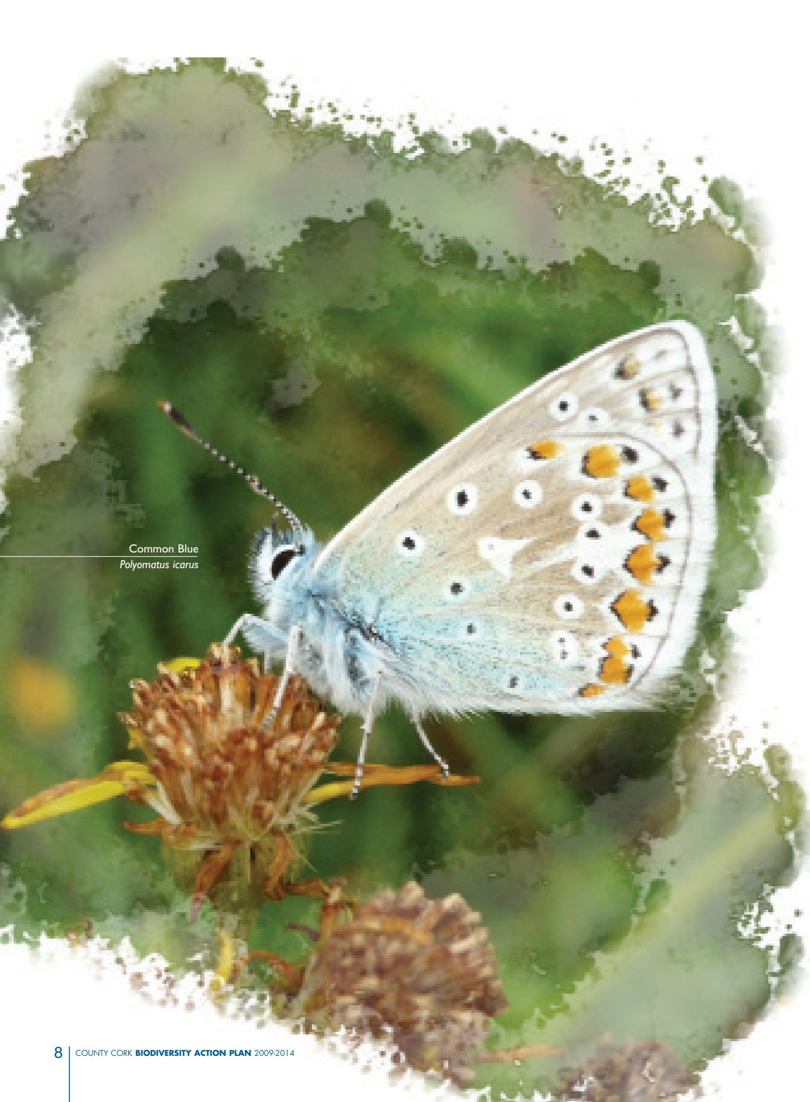
Common Blue Polyommatus icarus

Biodiversity "The variability among living organisms from all sources including, inter alia, terrestrial, marine and other aquatic ecosystems and the ecological complexes of which they are part; this includes diversity within species, between species and of ecosystems" (UN Conference on Environment and Development (Earth Summit) 1992.