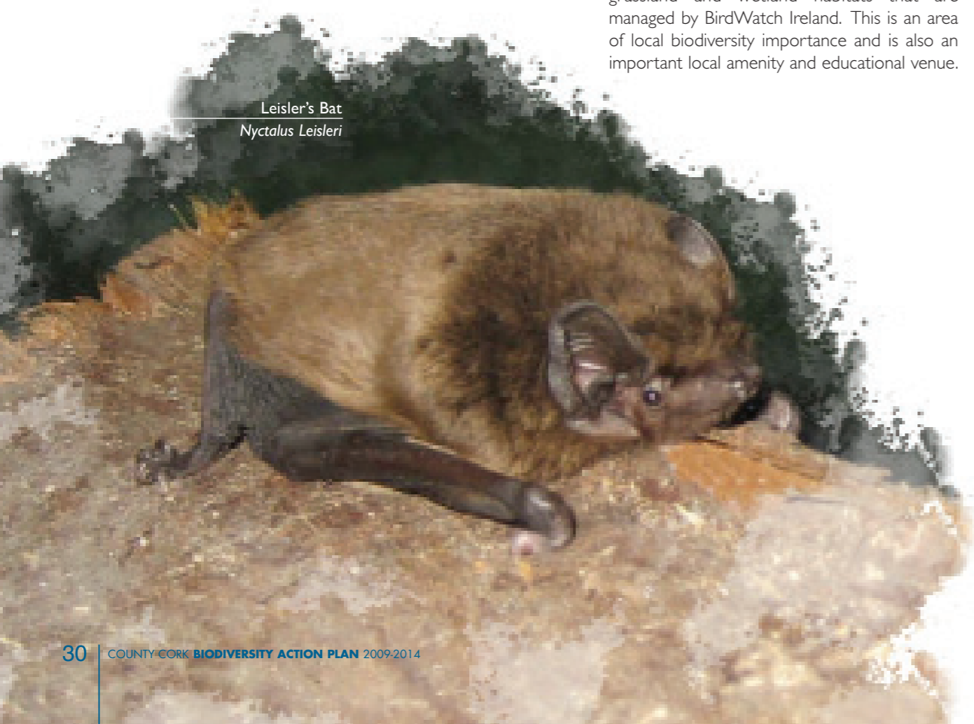
Leisler's Bat Nyctalus Leisleri

Cuskinny Marsh Nature Reserve near Cobh, is a privately owned mixture of lake, woodland, grassland and wetland habitats that are managed by BirdWatch Ireland. This is an area of local biodiversity importance and is also an important local amenity and educational venue.