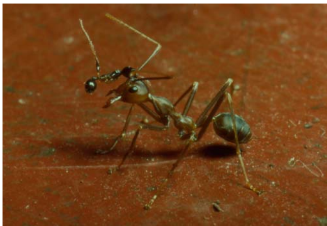
Fig. 4 After a battle a Tetramorium aculeatum worker is still biting one antenna of an Oecophylla longinoda major worker.

mones) that separate them from neighboring colonies so that encounters with alien workers are infrequent (Hölldobler and Wilson 1990a [p. 287]; Offenberg 2007). Fighting nevertheless does occur when growing colonies expand their territory ( Fig. 4 ; Jackson 1984a). After the experimental elimination of a dominant colony through the use of insecticides, neighboring colonies rapidly expanded their territories (Majer 1976a), providing evidence for territorial conflicts between neighboring colonies.