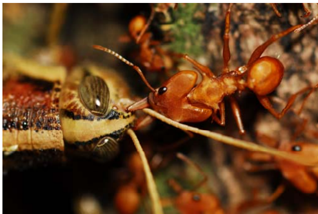
Fig. 2 A Daceton armigerum worker capturing a locust. This arboreal-dwelling myrmecine species belongs to the tribe Dacetini whose other species are ground-dwellers specialized in collembolan predation. Note the heart-shaped head and the hypertrophied trap-jaw mandibles.

with nutrients (Beattie and Hughes 2002; Heil and McKey 2003). For example, in the association between Central American Acacia spp. and ants of the genus Pseudomyrmex , the plants provide ants with EFN and protein-rich FBs, while the ants protect the host-tree foliage from herbivorous insects and mammals through their territorial aggressiveness (they do not hunt). They also kill neighboring trees and encroaching vines by stinging them, preventing their host Acacia from being overwhelmed. Myrmecotrophy, or the ability of certain plants to absorb nutrients from the refuse of their associated ants, has mostly been demonstrated for epiphytes. Yet, this adaptation to live in nutrient-poor environments has also been noted for several geophytic myrmecophytes (Rico-Gray and Oliveira 2007). Although most myrmecophytic species need sunlight (but some can develop in the understory), they are mostly found in pioneer formations and only a few, such as Tachigali spp. and Cecropia spp. in the Neotropics and Barteria fistulosa in Africa, can be found in rainforests where they are able to reach the canopy (Fonseca and Benson 2003; Davidson 2005a; Dejean et al. 2007a).