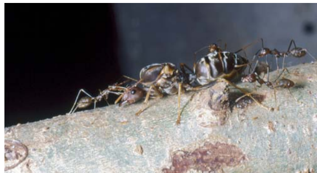
Fig. 7 Major workers watch over the moving of an Oecophylla longinoda queen.