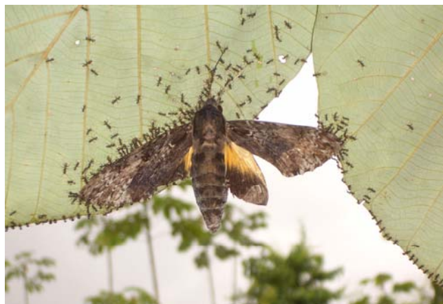
Fig. 9 Associated with the myrmecophyte Cecropia obtusa , Azteca shimperi workers group ambush by positioning themselves side by side along the leaf margins. They are able to capture large prey thanks to their powerful claws and adhesive pads.

We saw that the predatory behavior of territorially-dominant arboreal ant species is well adapted to hunting in tree foliage. Workers ambush in a group, they spread-eagle flying insects and then retrieved them whole collectively or cut them up on the spot; depending on the ant species, they can use venom or not. Note that because they limit their activity to their host-myrmecophyte foliage, some plant-ants have evolved even more stunning behaviors. Azteca shimperi workers group ambush their prey by placing themselves side-by-side along the underside of a leaf, with just their wide open mandibles visible from the leaf margin. When a prey item lands on the leaf, the vibrations trigger the workers to rush to the prey and seize it, and then spread-eagle it (Fig. 9; unpublished data; see also Morais 1994). Tetraponera aethiops workers bore entrances into the hori-