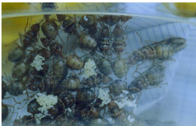
Fig. 8 Pleometrosis in Oecophylla longinoda . In this species several queens can collaborate to found a new colony (pleometrosis), permitting incipient colonies to grow faster than during haplometrosis, or the foundation by only one queen.

the base of the branch. Then, as the colony increases in size it occupies all of the main branches of the tree one after the other and the corresponding foliage; at the end of the process they have occupied the entire tree crown and can easily defend only the upper part of the trunk from the attempts by ground-nesting, plant-foraging ants at incursions.