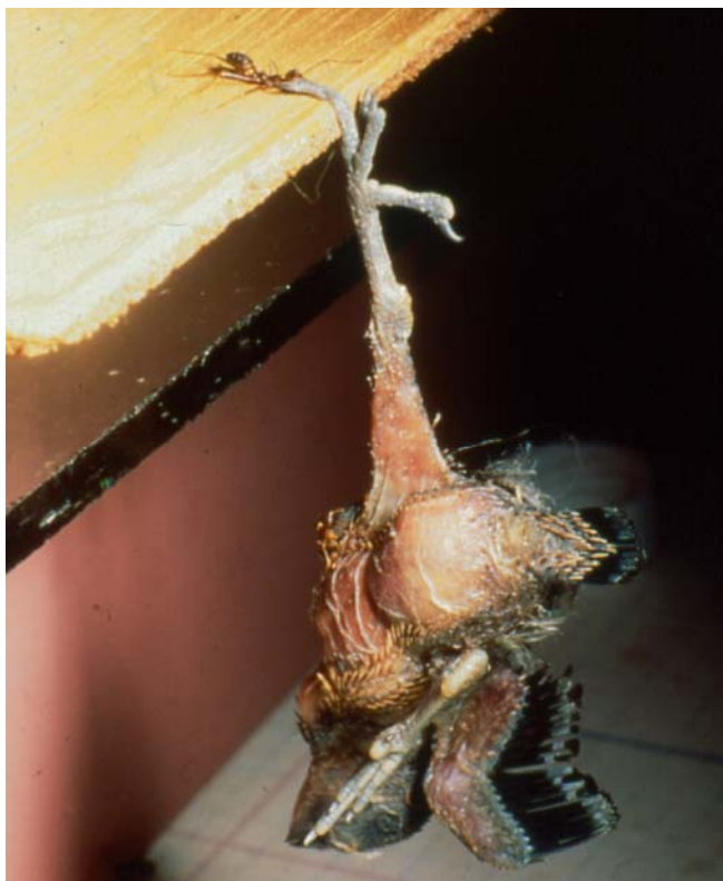
Fig. 5 An Oecophylla longinoda worker is able to hold onto a small bird alone while its nestmates recruit other workers at long range, illustrating the power of the worker's claws and adhesive pads.

The predatory behavior of the weaver ant, Oecophylla longinoda , the first species studied in this context, is adapted to the fact that in a tree's foliage most prey are likely to escape by flying or jumping away or by dropping. Workers hunt diurnally in groups. Prey detected visually from a relatively long distance are seized by an appendage and immobilized by a first worker that then releases a pheromone to attract nestmates. Recruited nestmates, in turn, seize a prey appendage and pull backward, spread-eagling the prey. This behavior, which is used even for relatively small prey, also permits the ants to capture large insects and even other animals (Dejean 1990a, 1990b; Hölldobler and Wilson 1990a). Entire prey are retrieved cooperatively, including, in some cases, heavy prey such as small birds (Fig. 5; Wojtusiak et al. 1995). This form of prey capture and