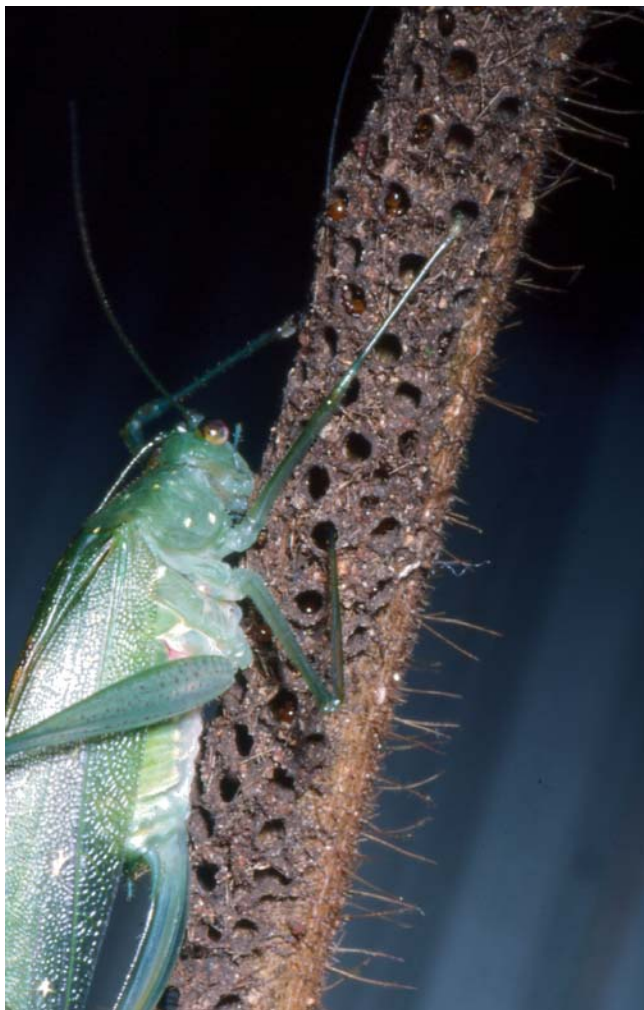
Fig. 10 Allomerus decemarticulatus workers build gallery-shaped traps along the twigs of their host myrmecophyte Hirtella physophora . Here a grasshopper is captured; note that the extremities of its legs are trapped in the holes of the gallery; workers that hide inside the gallery, under the holes, firmly hold the tips of the prey's appendages.

zontal, hollow branches (domatia) of their host Barteria fistulosa near the base of the petiole of the alternate, horizontal leaves. Hidden in the domatia, close to these entrances, they then ambush flying insects. After perceiving the vibrations caused when an insect lands on a leaf, they rush to it, sting it and generally recruit nestmates to spread-eagle it (Dejean et al. 2007b). Plant-ants of the genus Allomerus collectively ambush prey by building galleries pierced with numerous holes serving as traps. When a prey lands on the gallery each worker waiting in a hole near the landing site seizes an appendage and pulls backward, moving deeper into the trap. With its appendages caught in the trap's different holes, the prey is immobilized and recruited workers sting it repeatedly (Fig. 10; Dejean et al. 2005). The same behaviors were observed in Azteca brevis (see Schmidt 2001; Longino 2007).