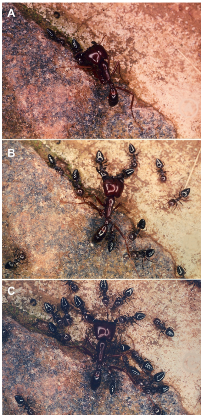
Fig. 6 Crematogaster gabonensis hunting an army ant Dorylus nigricans soldier (in Cameroon) on the ground. (A) A first worker discovers the Dorylus soldier and, emitting an alarm pheromone, begins to recruit nestmates. (B) Several recruited workers arrive and begin to bite the soldier. (C) The soldier is spread-eagled by numerous Crematogaster gabonensis workers.

retrieval requires that the workers adhere to the substrate by means of very powerful adhesive pads and claws, a characteristic that seems general in arboreal species (Wojtusiak et al. 1995; Federle et al. 2000; Djiéto-Lordon et al. 2001; Orivel et al. 2001; Richard et al. 2001).