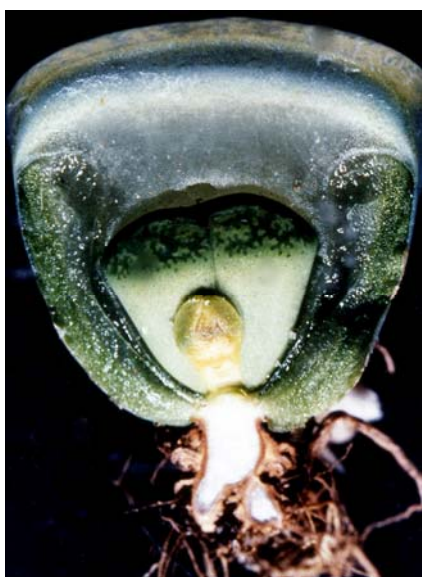
Fig. 1 A Lithops plant in which one old leaf was removed, showing the other old one, the new developing leaves and the flower bud. The short stem connects the leaves to the root system.

In succulent plants movement of water between old and young leaves or stems has sometimes, but not always, been observed (e.g. Tüffers et al. 1995). When water movement has been observed, it either occurs according to (Herrera et al. 2000) or against (Wang et al. 1997; Nerd and Neumann 2004) a water potential gradient. Though there are several phytogeographic and taxonomic papers (e.g. Sprechman 1970; Wallace 1990; Hartmann 2001a, 2001b) and some physiological and ecological ones (e.g. Eller and Ruess 1982; Eller and Nipkow 1983; Albanese et al. 1989), to our knowledge there are practically no investigations in Lithops on the driving forces that cause the movement of water