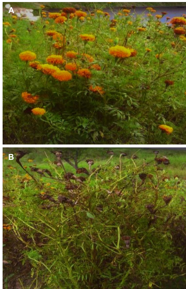
Fig. 2 Mancozeb-treated (A) and untreated (control) plants (B) of African marigold ( T. erecta ) in a field.

Alternaria zinniae , the cause of leaf spot and flower blight of African marigold ( Tagetes erecta ), is seed-borne in nature. There is a need to eradicate it by seed treatment with fungicides such as mancozeb, chlorothalonil, captan or zineb at optimum doses or at lower doses if it hampers seed germination. These fungicides also effectively lowered the diseases severity to a minimum damage as foliar applications in the field. Even though the disease can be controlled by chemical means, the approach is not environmentally friendly. Biotechnological means through the production of disease-free plants by tissue culture and gene transfer techniques is required for Tagetes .