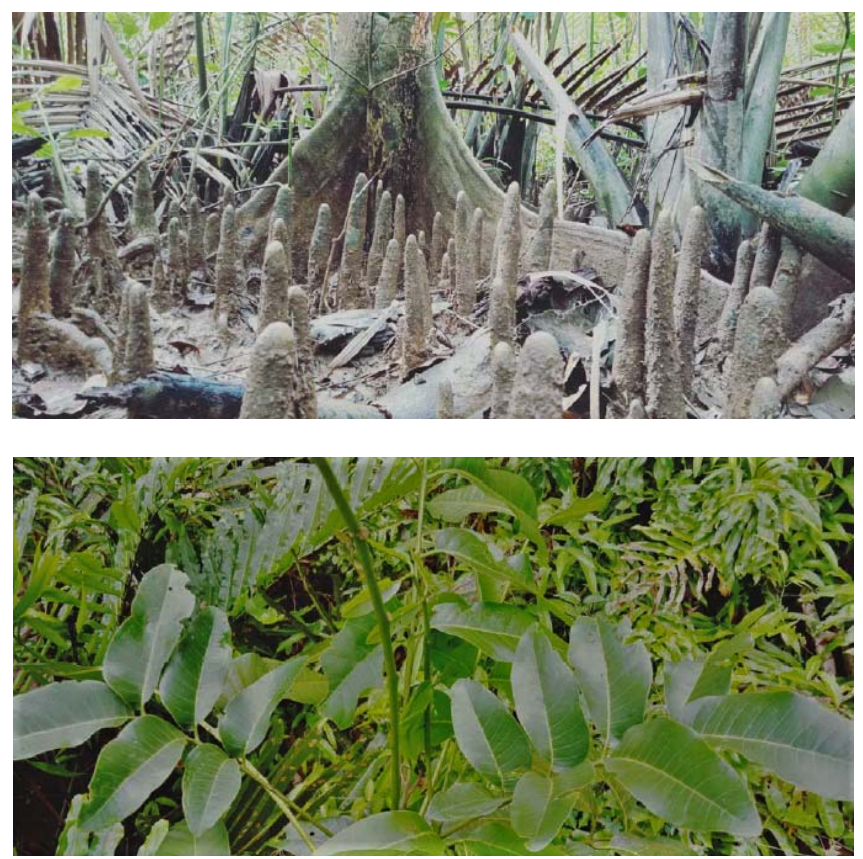
Figure 3 Pneumatophores (top) and leaves (bottom) of Aglaia cucullata.

On the forest floor, pneumatophores or aerial roots are densely developed (Figure 3). The soft and muddy substrate with silty clay is conducive to the production of many pneumatophores which are spongy, greyishbrown in colour and 5–70 cm in height. The leaves are compound bearing 6–8 leaflets (Figure 3). Lamina of leaflets are slightly asymmetrical and elliptic with a rounded apex. Overall, the leaves do not have obvious signs of halophytic tendencies such as shiny cuticle or succulence.