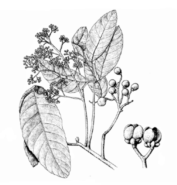
Figure 1 Line drawing of a twig of bearing leaves, flowers and fruits of Aglaia cucullata (From Giesen et al. , 2007).

The genus Aglaia (previously known as Amoora ) comprises 25–30 species, many are economically important timber trees (Xu et al. , 2019). Described in the Mangrove Guidebook for Southeast Asia by Giesen et al. (2007), Aglaia cucullata (Roxb.) Pellegr. (Figure 1) belongs to the family Meliaceae. The species occurs in lowland forest and along tidal riverbanks. A mangrove associate, A. cucullata is a small to medium-sized tree with plank buttresses and pneumatophores. The bark is smooth, brown or pale orange, and somewhat scaly. The wood is pale yellowish to orange-brown, with white latex. Leaves are compound bearing 5–9 asymmetrical leaflets. Inflorescences are in clusters, each bearing numerous small, yellowish flowers, with three petals and six slightly protruding anthers. Fruits are round with leathery skin and they split into three locules each containing one seed wrapped by a shiny red aril.