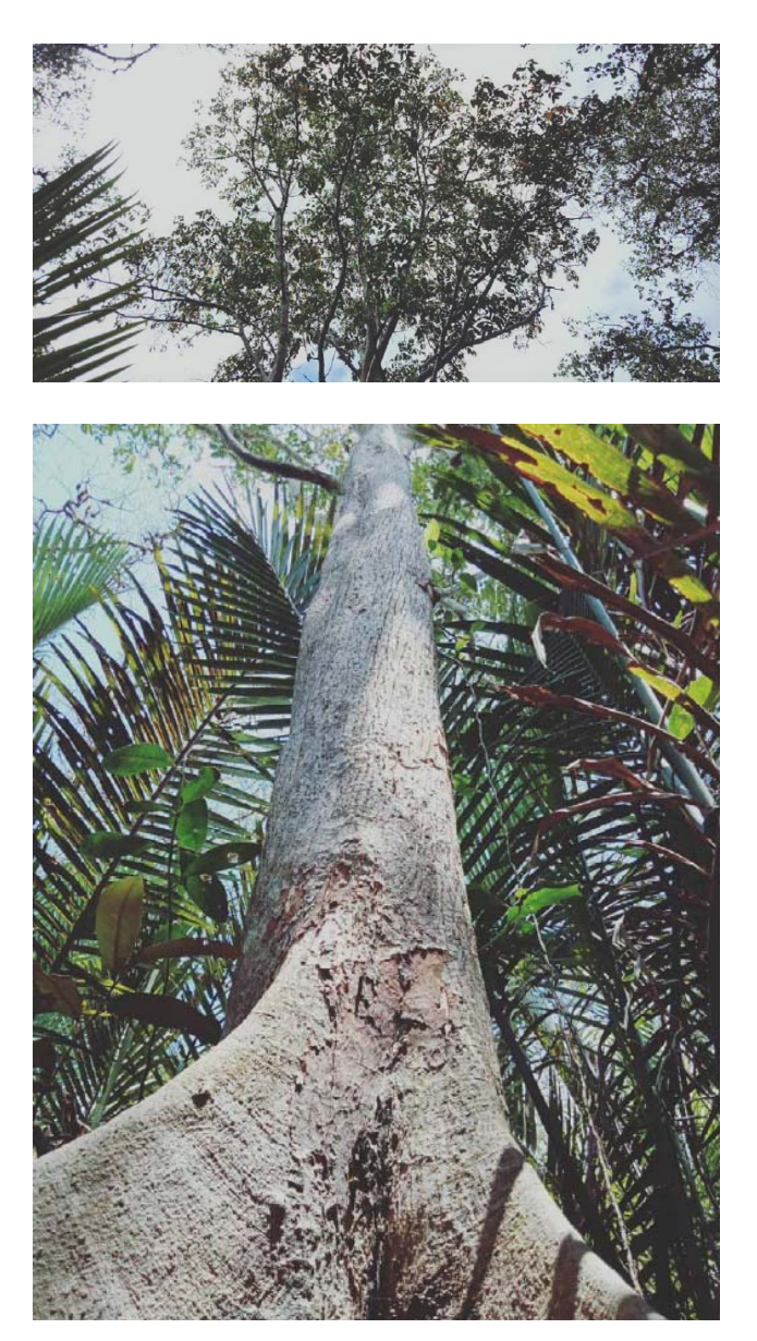
Figure 2 A cluster of mature Aglaia cucullata trees (top), and the bole and buttresses of one individual (bottom) in the Ranong mangrove forest.

In July 2020, we encountered a natural population of A. cucullata in a remote and undisturbed habitat located some 2 km landward from the banks of the Kraburi River, Ranong Province, Thailand. The 48,000-ha site is within the proposed World Heritage mangrove forest. It was designated a UNESCO Biosphere Reserve earlier in 1997. At the site, a group of five mature trees, all above 30 cm in dbh and 15–20 m in height (Figure 2). The trees have a clear bole with bark that is greyish-brown in colour and faintly fissured. Buttresses are up to a metre tall. The mangrove palm Nypa fruticans and fern Acrostichum aureum are common in the area.