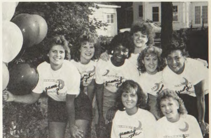
Bid day brings new members to the University of Oregon chapter.