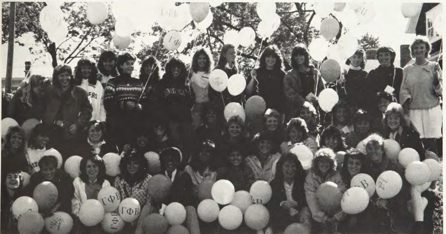
Balloons welcome new members on bid morning at Rutgers.