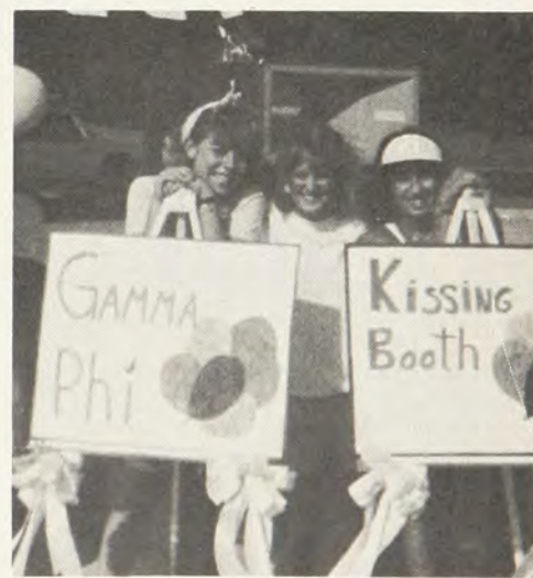
Beta Chi (Wichita St.) collegians sell chocolate kisses at their kissing booth.