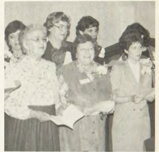
Philadelphia North alumnae (above) serenade LaSalle collegians who later entertained with a Gamma Phi Beta game (below).