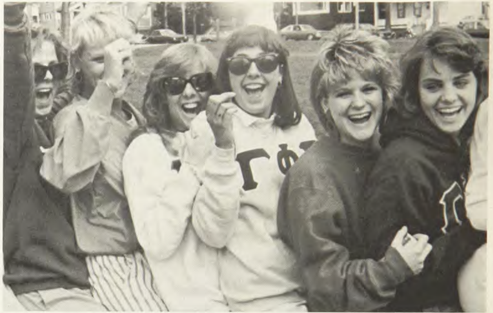
Sisterhood abounds at the Gamma Chapter (Wisconsin) retreat.

Beta Chi (Wichita St.) held successful fundraisers for muscular dystrophy, Big Brothers/Big Sisters, Diabetes Foundation and UNICEF. The chapter also received the award for "most participation" at the Kidney Foundation Dance Marathon