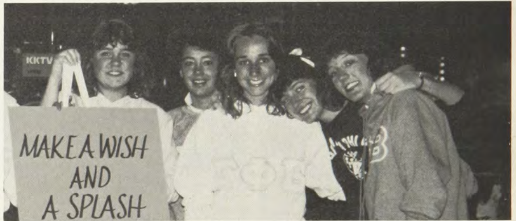
Colorado State members participate in an Easter Seals fundraiser.