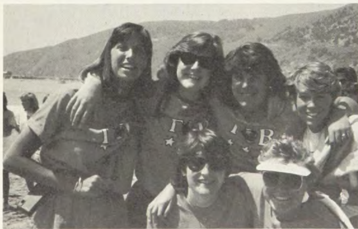
Delta Theta (Cal. Poly-San Luis Obispo) sisters show their Greek Week spirit.