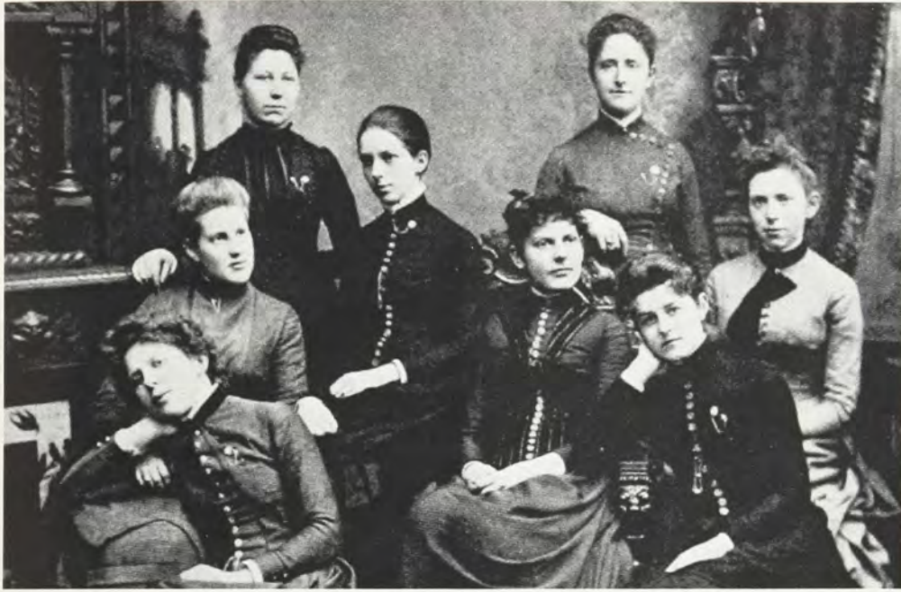
Delta Chapter charter members were initiated in 1887.