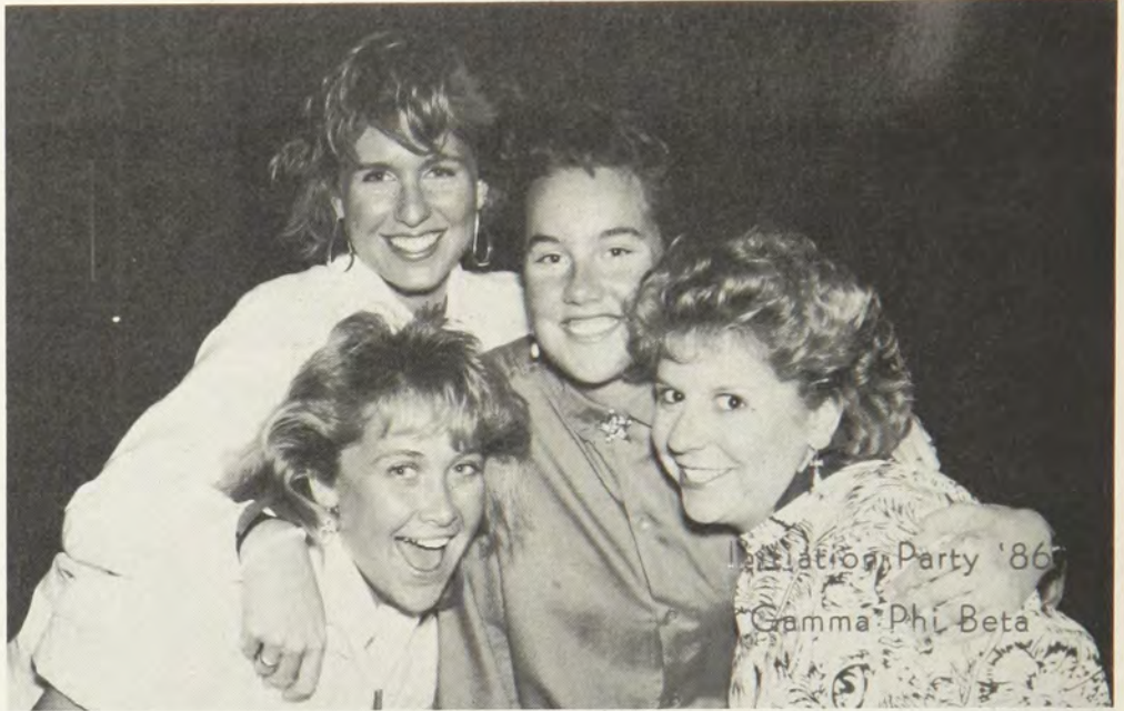
Alpha Epsilon sisters attend the initiation party at the University of Arizona.