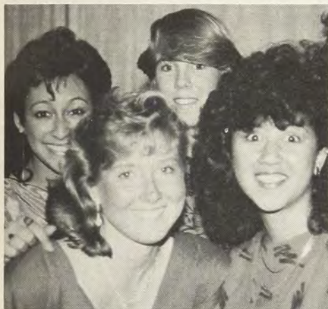
The chapter Christmas party is a special event at California State-Fullerton.