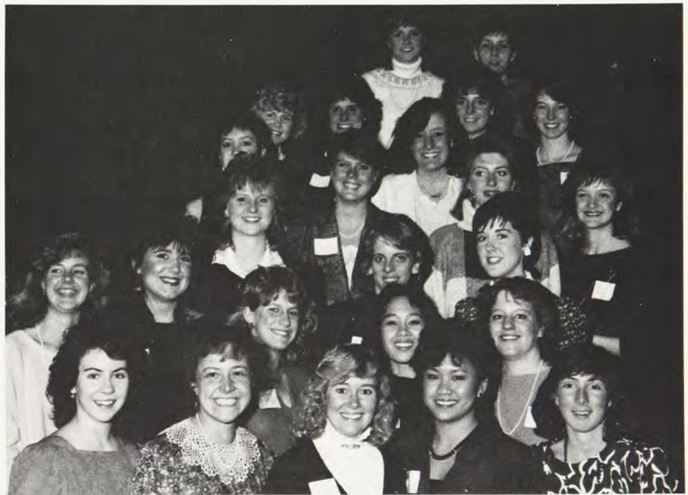
The first initiates of the rechartered Delta Chapter were initiated February 16, 1986.