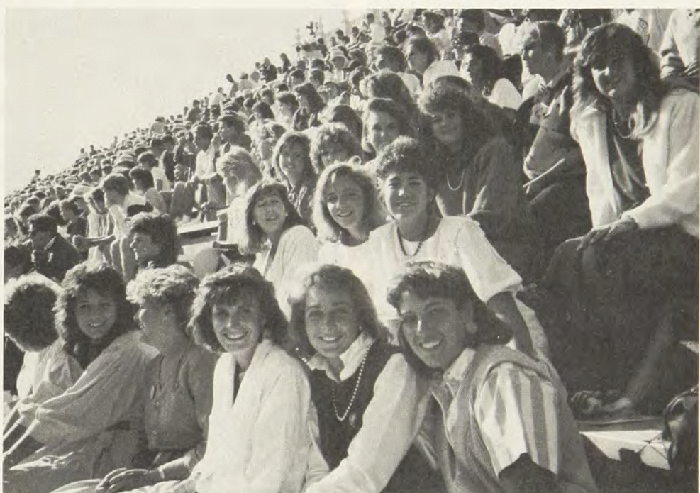
Epsilon Gamma (San Diego) members cheer their team at the Homecoming game.