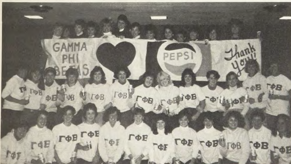
Wisconsin-Oshkosh sisters pose during the Pepsi/Gamma Phi Beta Dance Marathon.