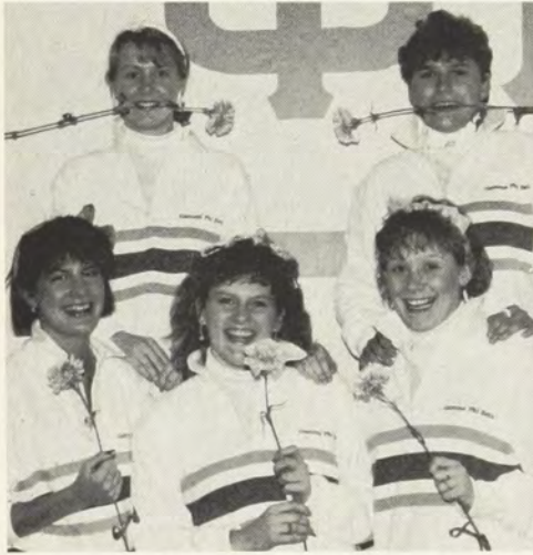
Alpha Omega (W. Ontario) sisters show their Gamma Phi Beta pride.