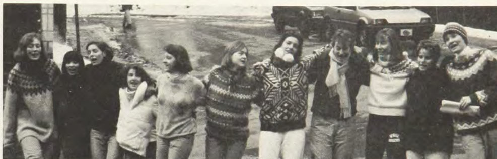
Pledges sing during Inspiration Week at McGill.