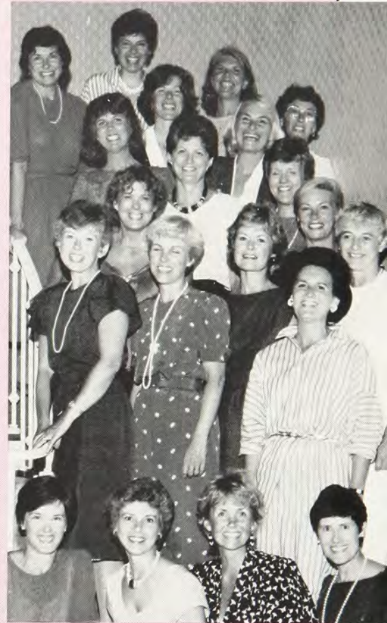
At their 20th reunion, Lambda alumnae learned the truth of a line from their pledge song: "Friendships here will be everlasting, Gamma Phi Beta for me."

All agreed it was a wonderful experience to see their Gamma Phi sisters again. During college they learned, played and grew to-