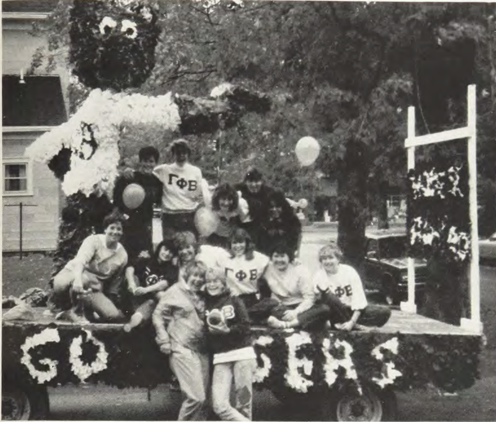
Wittenberg Gamma Phi Betas placed first in Homecoming float competition.