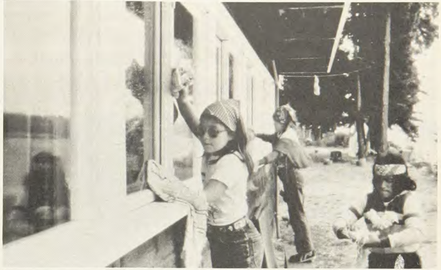
Chores are a part of the camping experience.