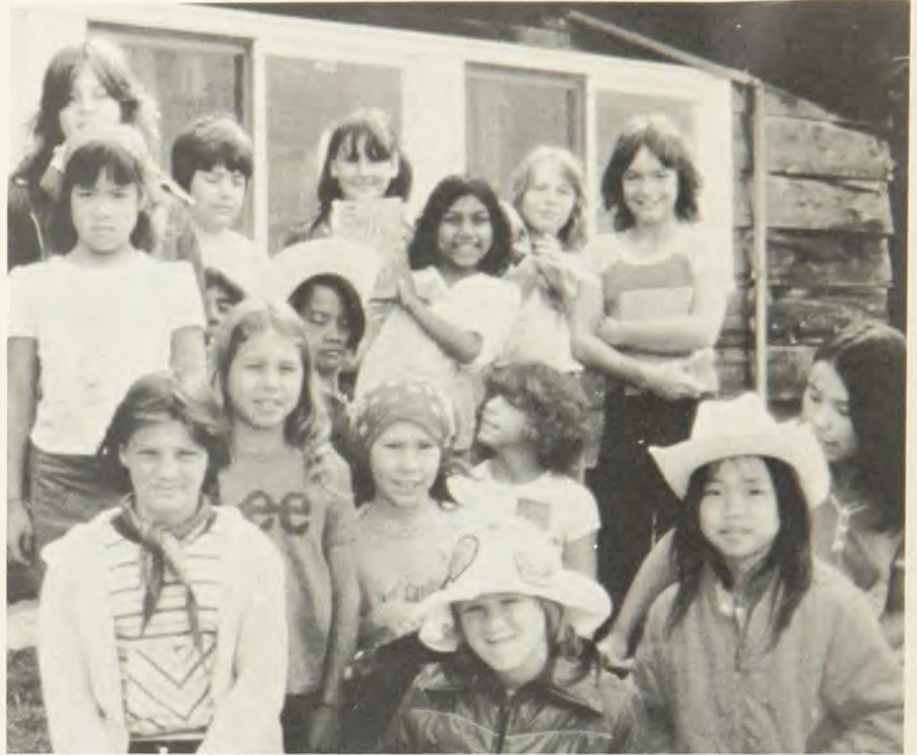
Camp Sechell campers pause between activities.