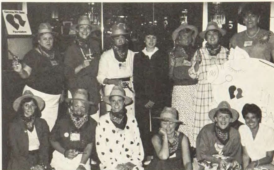
With guns cocked, these Gamma Phi Betas raided the Dallas Convention.

Armed robbery can be an effective fund raising tool when it's all in fun.