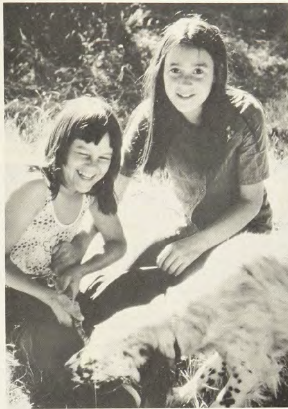
Happy campers play fetch.