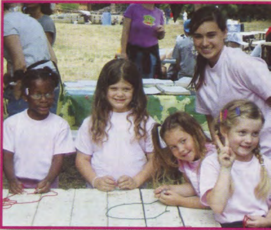
Girls share a variety of experiences at a camp.