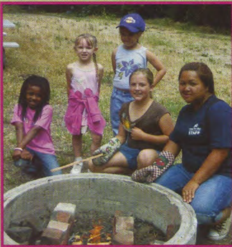
Gamma Phi Beta sisters from Zeta Rho Chapter (Texas A&M College Station) help serve meals at camp.

Campers gather around the fire pit at a camp in Southern California.