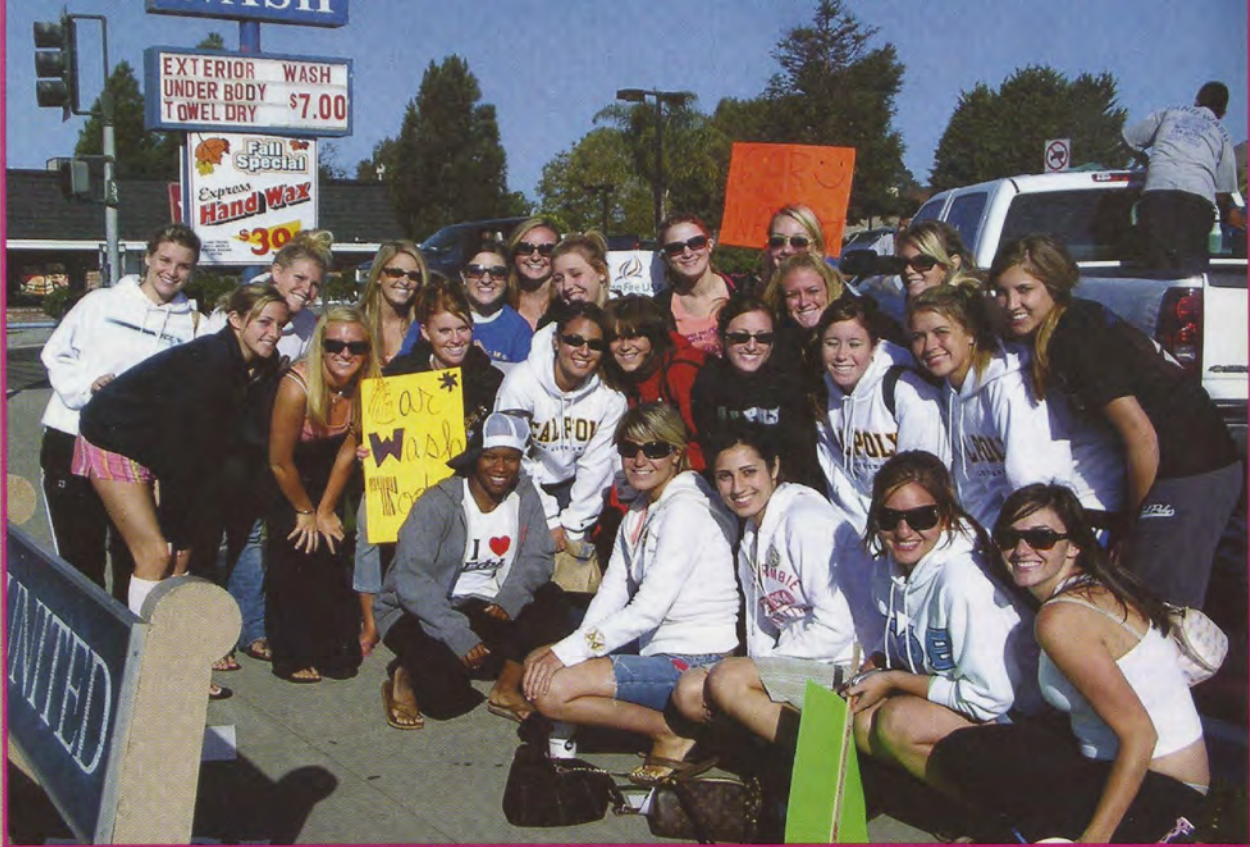
Members of Delta Theta Chapter (California Polytechnic) held a car wash as their fundraiser for camping.

Campers gather around the fire pit at a camp in Southern California.