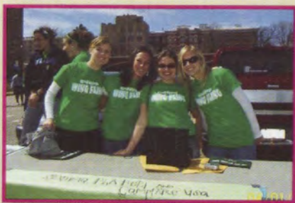
Epsilon Delta's Wing Fling raised $3,000 For Camp Fire USA in Omaha.

Congratulations to all the Gamma Phi Beta groups who went above and beyond in fundraising in support of the Sorority's philanthropy. The campers truly appreciate your hard work!