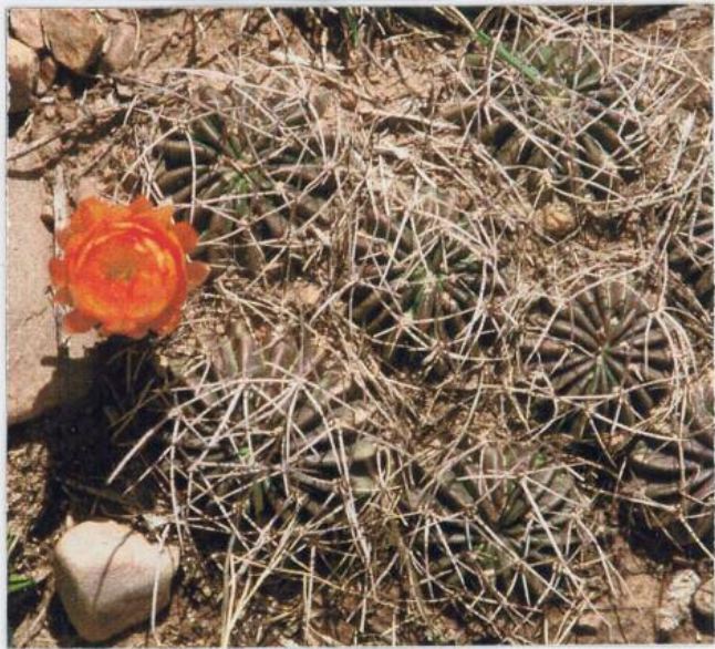
Between Panduro and Eucalyptos