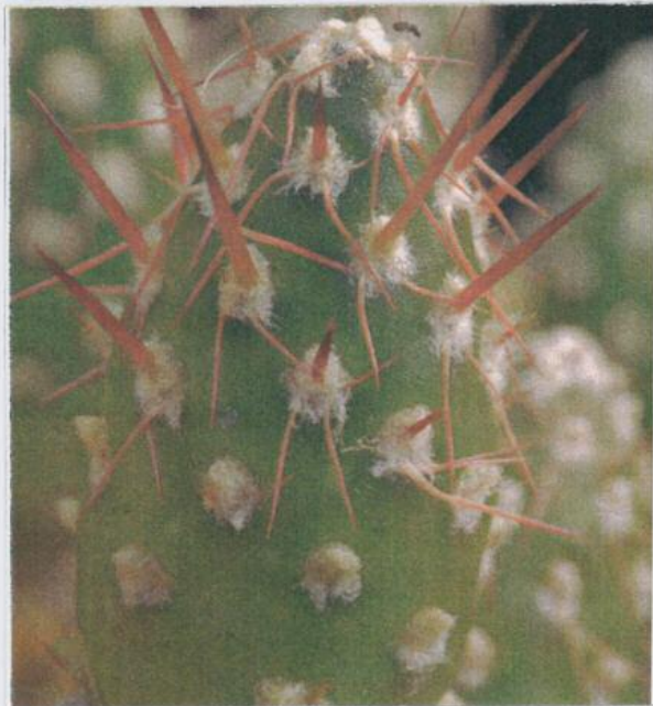
Cuesta de Diablo Tephrocactus conoideus