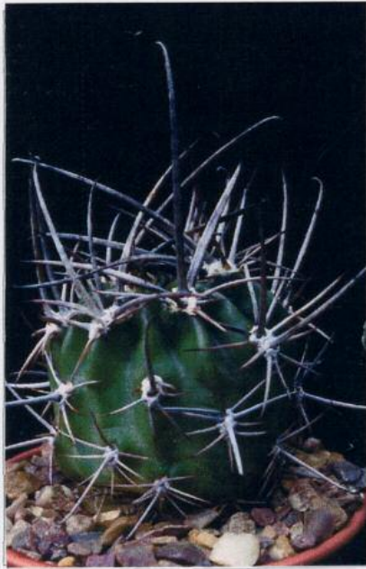
Challapata