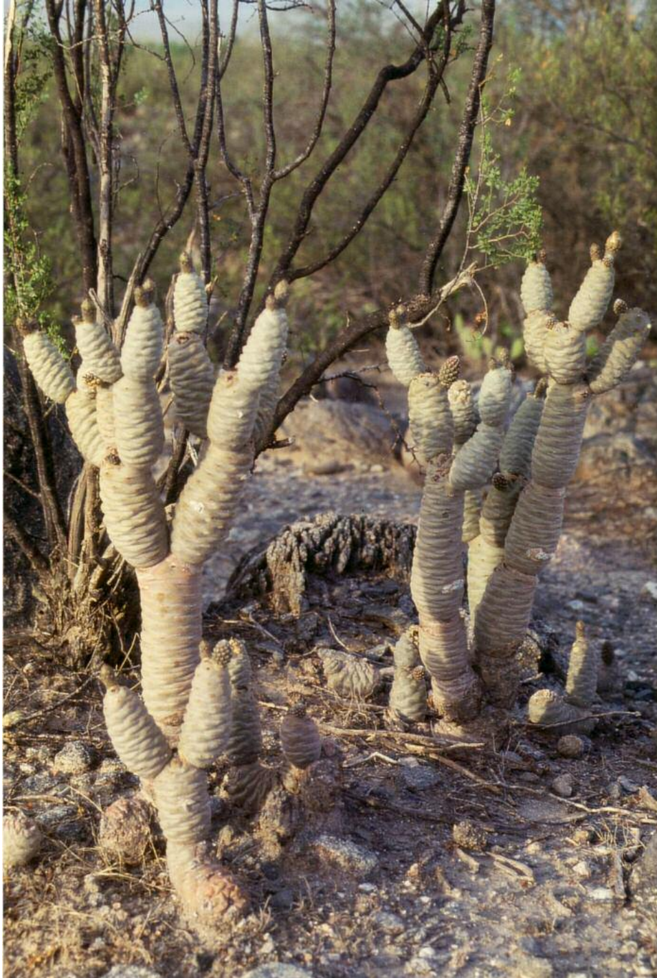
Tephrocactus strobiliformis Saujil, Catamarca, Argentina