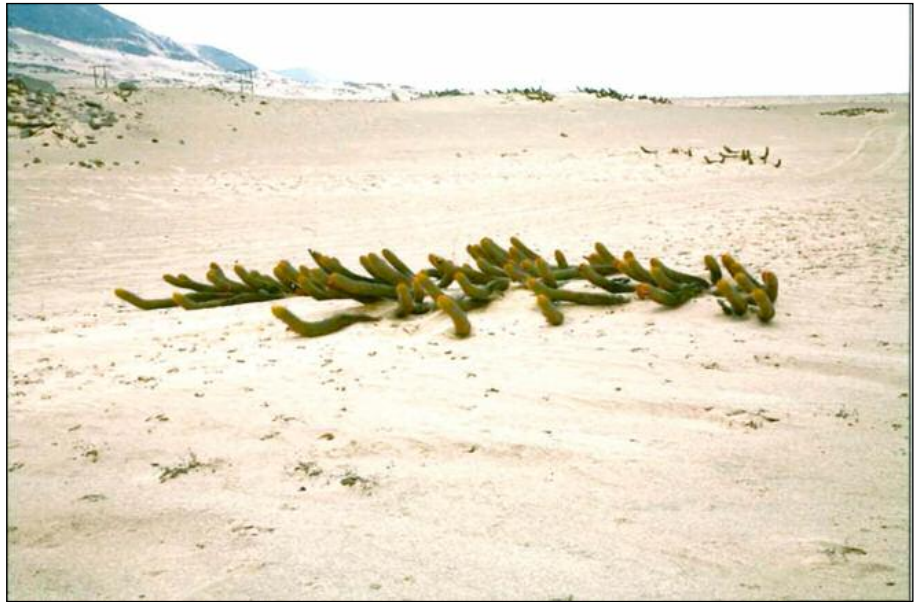
Haageocereus repens near Trujillo