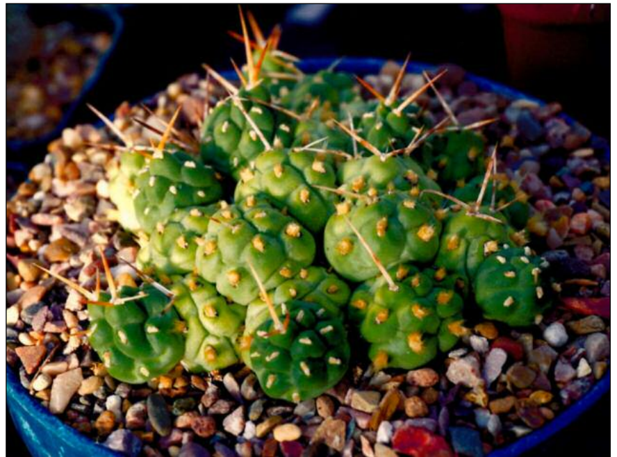
Tephrocactus rossianus RH887