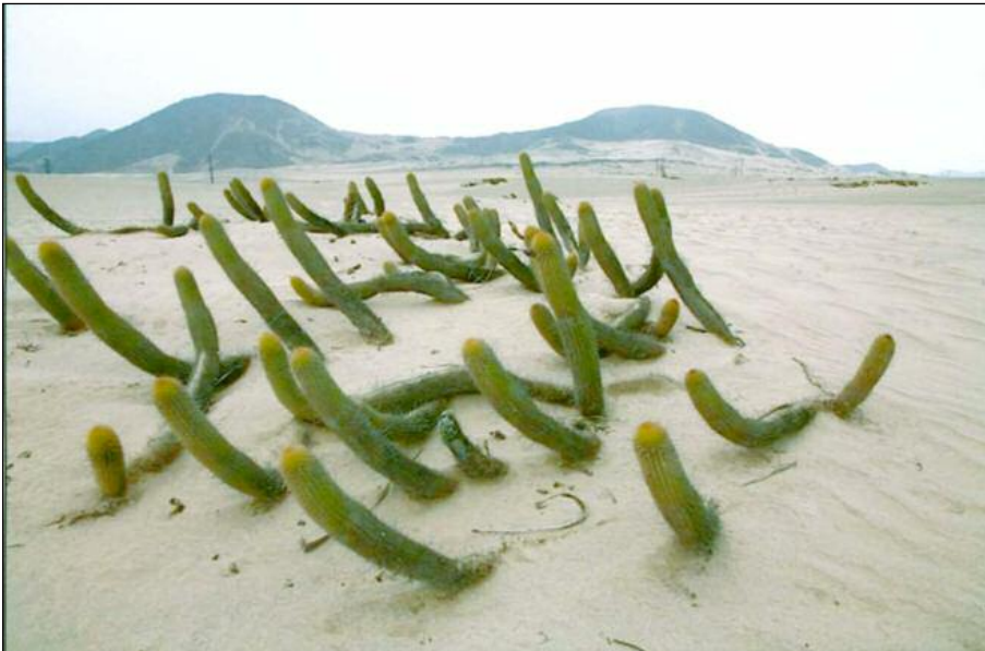
Haageocereus repens near Trujillo