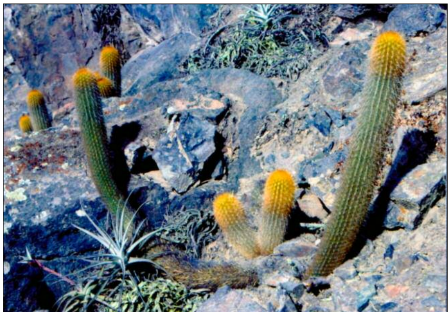
Haageocereus repens near Trujillo