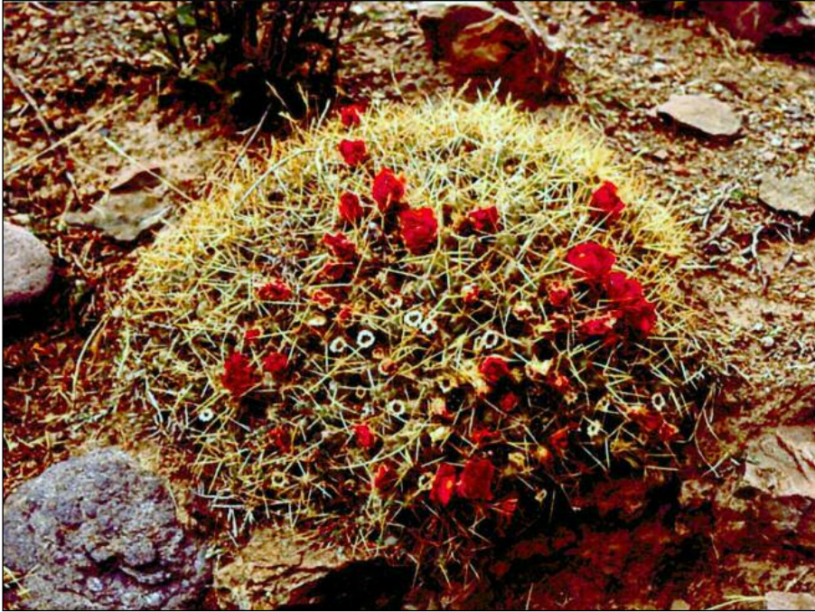
Tephrocactus pentlandii near Cieneguillas