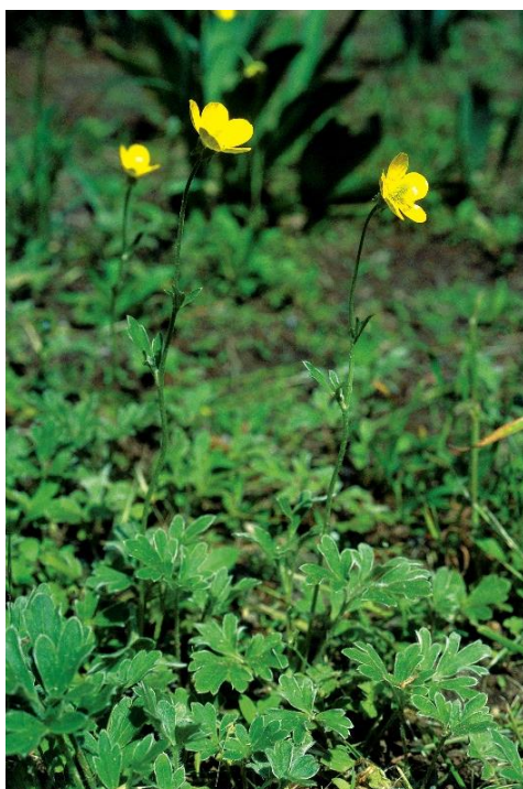
Fig. 1 Ranunculus psilostachys Griseb.

Nagyharsány: (1) the species was found in May 1962 on the south-facing near-