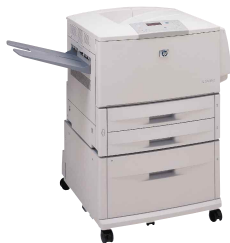
hp LaserJet 9000dn printer with optional 2000-sheet feeder