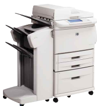
hp LaserJet 9000mfp printer with optional stapler/stacker

The HP LaserJet 9000 series is one of a new generation of internet enabled devices, offering general office users in demanding workgroup environments outstanding high volume performance from a proven reliable platform.