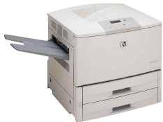
hp LaserJet 9000n printer