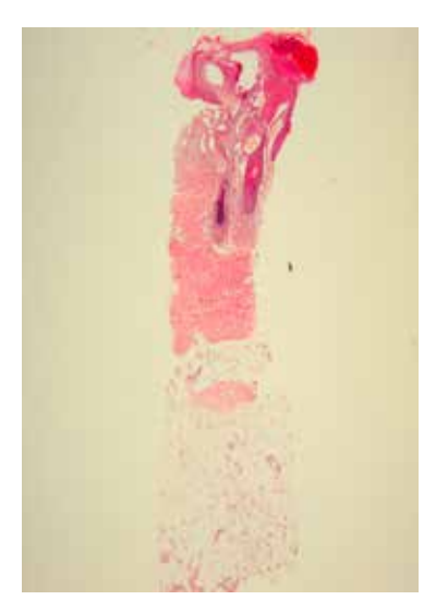
Fig. 3 Hyperkeratosis, acanthosis and elongated curved rete ridges. The dermis and subcutis show dilated vascular spaces

Magnetic resonance imaging (MRI) of the left lower limb showed cutaneous and subcutaneous angiomatosis representing low-flow angiomas.