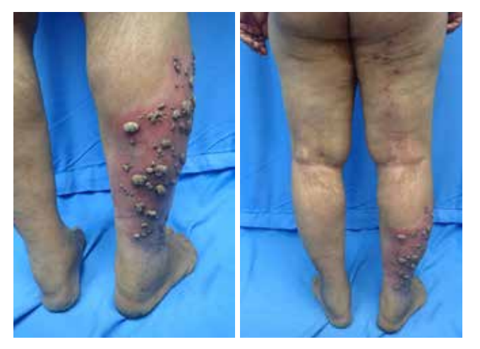
Fig. 1 & 2 A large, well-demarcated, erythematous and edematous plaque measuring approximately 25 x 10 cm studded with multiple verrucous lesions along with some small discrete plaques around the main lesion in a linear pattern

Physical examination showed, a large, well-