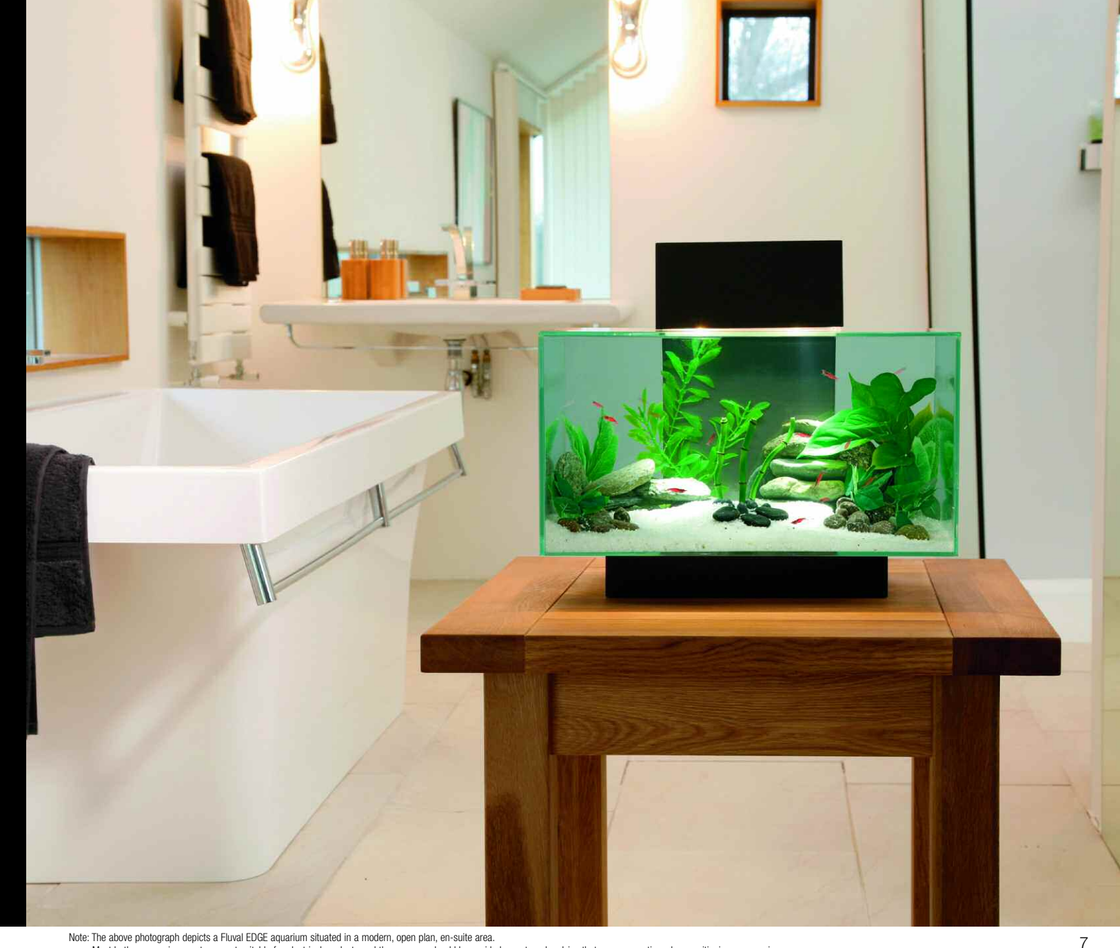
Most bathroom environments are not suitable for electrical products and these rooms should be avoided, we strongly advise that you use caution when positioning an aquarium.