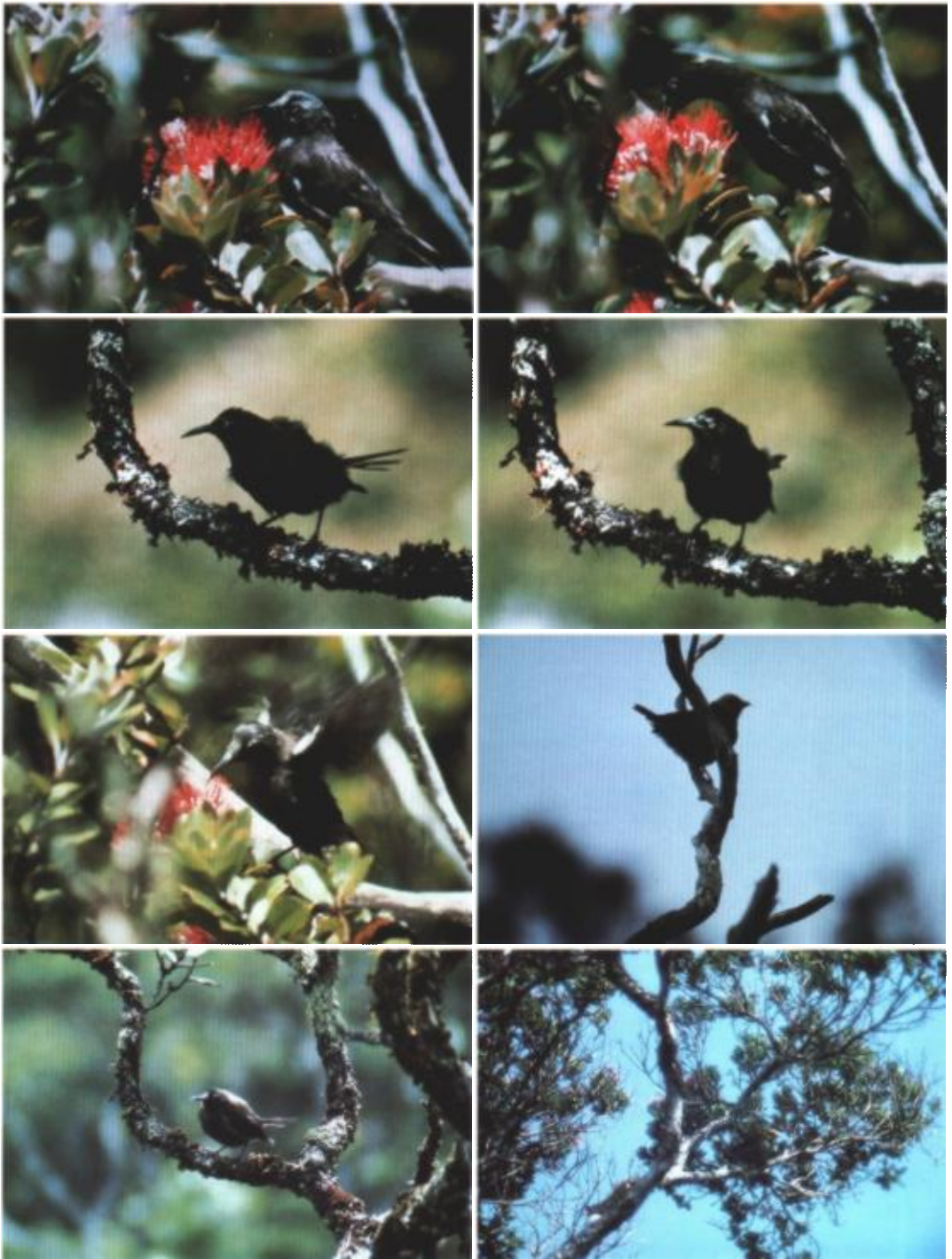
FRONTISPIECE. Upper 4 and lower left 2: Now extinct Kaua'i 'O'o ( Moho braccatus) in various attitudes. Lower right 2: The nearly extinct 'O'u ( Psittirostra psittacea) in characteristic postures.