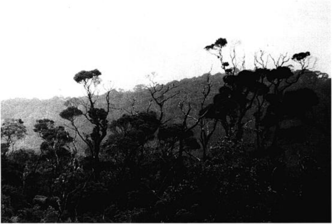
FIG. 2. Profile of forest canopy in the study area showing emergent 'ohi'a snags.

cludes abundant mosses and ferns as well as flowering plants.