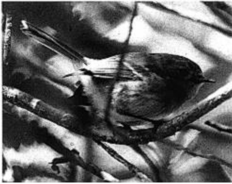
FIG. 3. Juvenile Kaua'i 'Elepaio.

cies, this cosmopolitan species may be a post-Polynesian colonizer of the Hawaiian Islands (Olson and James 1991).