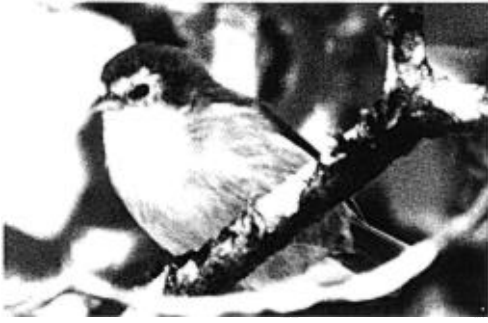
FIG. 7. Juvenile 'Akikiki ( Oreomystis bairdi ) showing distinctive white "spectacles," Alaka'i Swamp, 1975.

Swamp Trail, the most reliable locality outside the preserve (Pratt 1993). Recently, 'Akikiki have again been found in encouraging numbers along the Mohihi-Waiialae Trail (Pyle 1996). Appropriately, the 'Akikiki is being considered for listing as an Endangered Species (T. Pratt, pers. comm.).