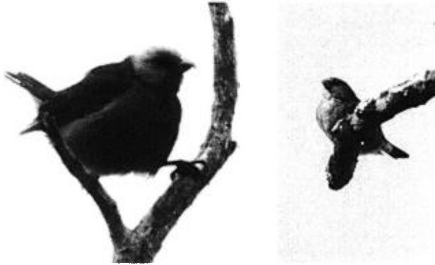
FIG. 5. 'O'u ( Psittirostra psittacea ) male (l.) and female (r.). See also Frontispiece.

Krakowski, who heard an 'o'o calling on 28 and 29 April 1987 (Pyle 1987). A survey by state agency biologists in February of 1989 found no 'o'o, and the report speculated that the birds were "now probably gone" (Pyle 1989). They have not been reported since and are undoubtedly extinct, their loud vocalizations being difficult to overlook.