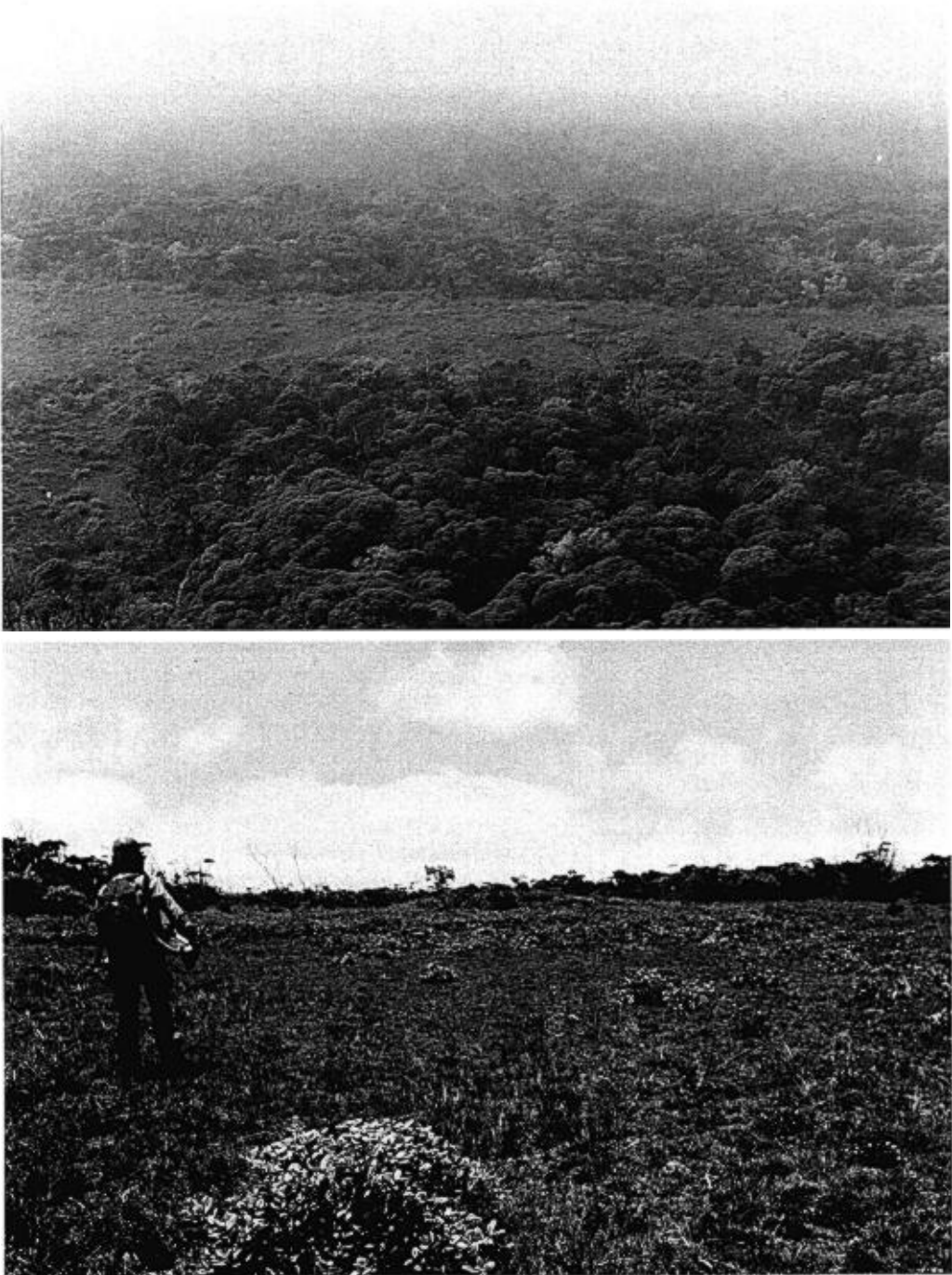
FIG. 1. Sincok's Bog as viewed from the air (upper) and from ground level (lower) with HDP in the foreground.