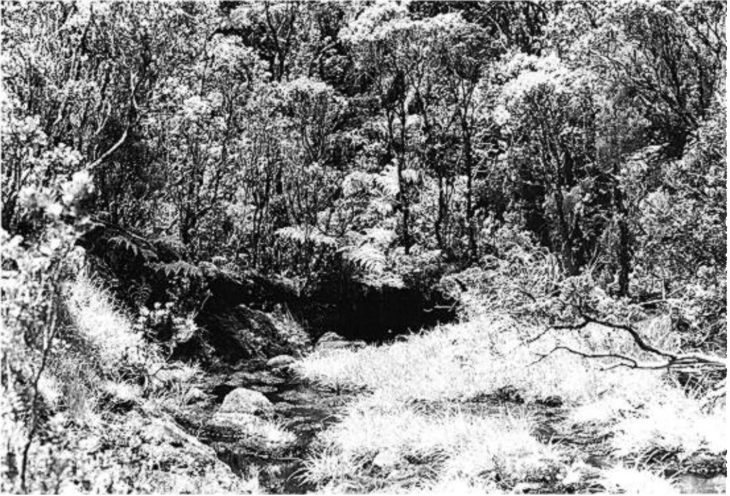
FIG. 4. An open area of stream bed on Halehaha Stream where HDP flushed a Puaiohi.

of intense observation and possible recovery actions by federal agencies and The Peregrine Fund. These ongoing studies have already discovered a larger than expected population (Pyle 1996) in the Koai'e Stream area (almost directly between Koke'e and our 1975 study site) where two nests were found about a decade ago (Ashman et al. 1984, Kepler and Kepler 1983).