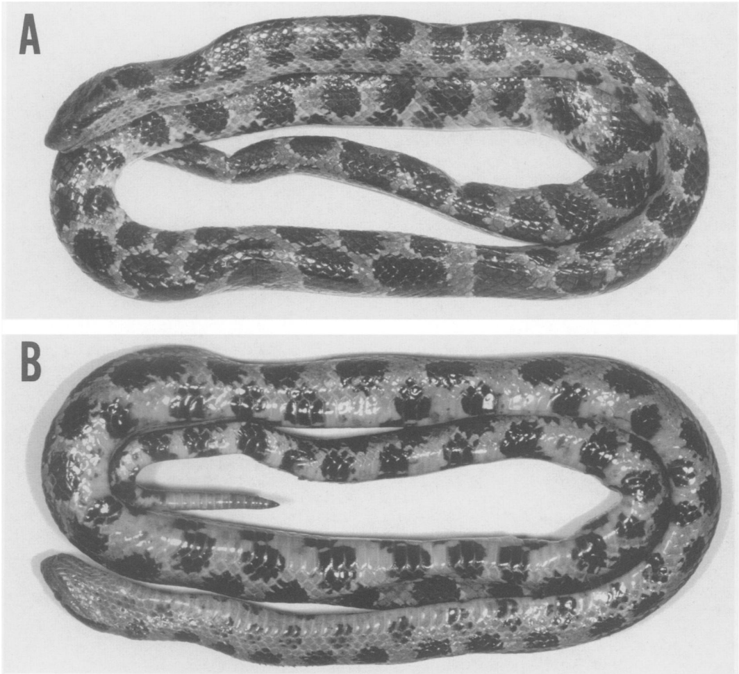
FIG. 1. Tropidophis spiritus (MNHNCU 4085), adult male, holotype. (A) dorsum, (B) venter.

79°21'38"W, collected in February 1993 by O. Jiménez.