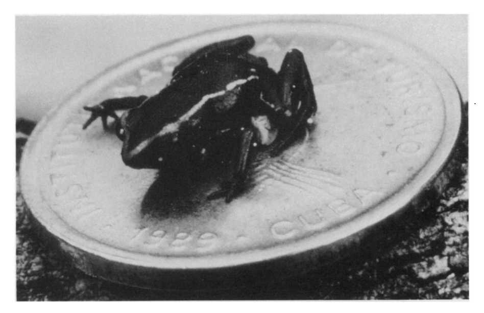
Fig. 1. Eleutherodactylus iberia , an adult male from Arroyo Sucio (Anacleto) Arriba, on the western slope of Monte Iberia, Holguín Province, Cuba, 600 m, collected by A. Estrada on 19 April 1993; photographed on a Cuban 10 centavos coin (21 mm diameter).