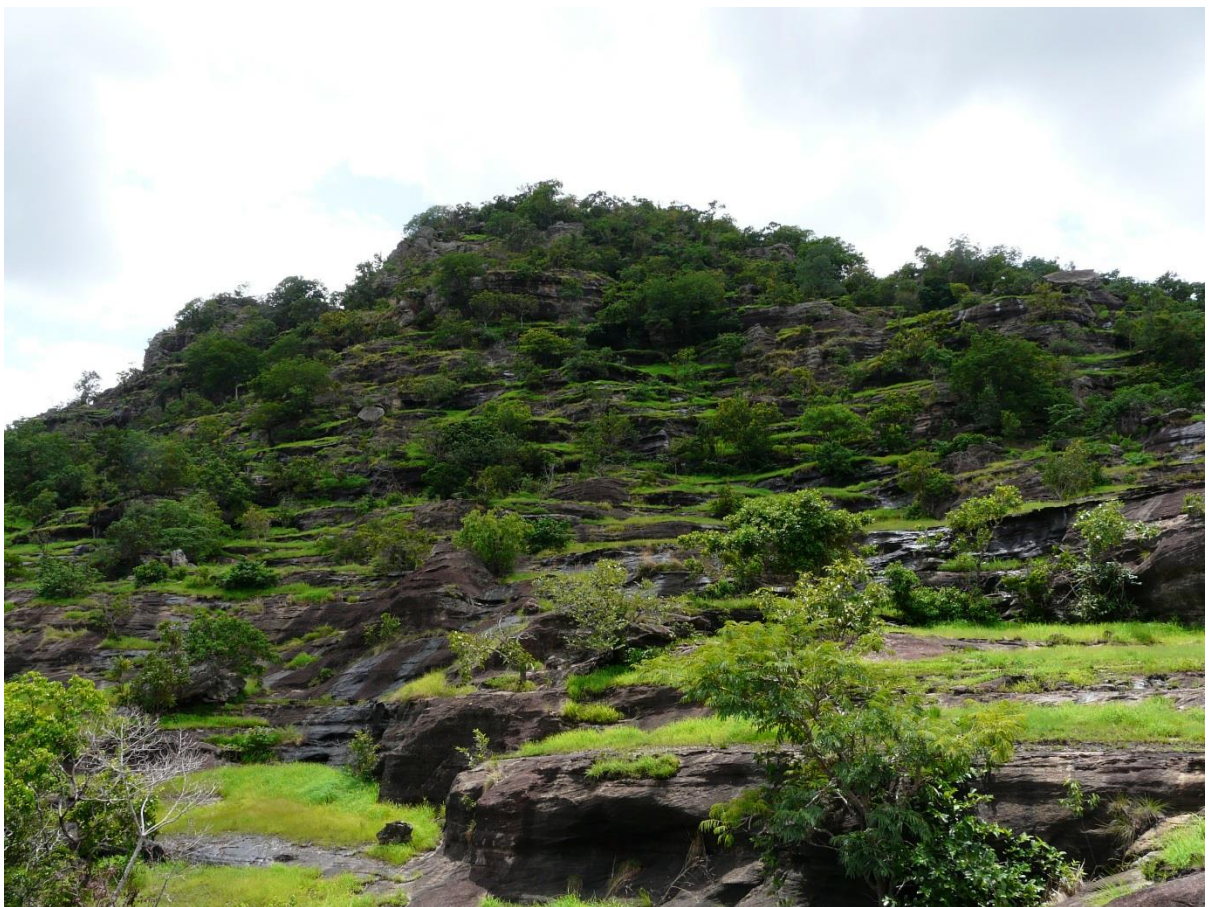
Sandstone Step Mountains, Mt Gangan, Kindia. June 2016.