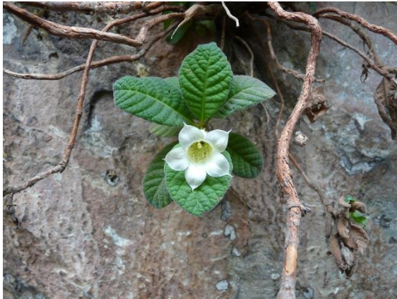
Kindia gangan Cheek