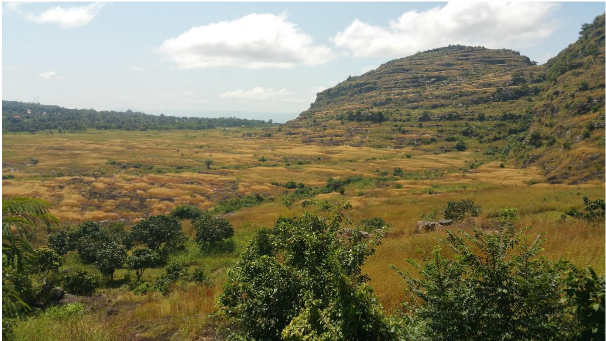
Low altitude sandstone bowl with Anadelphia chevalieri . Oct 2017