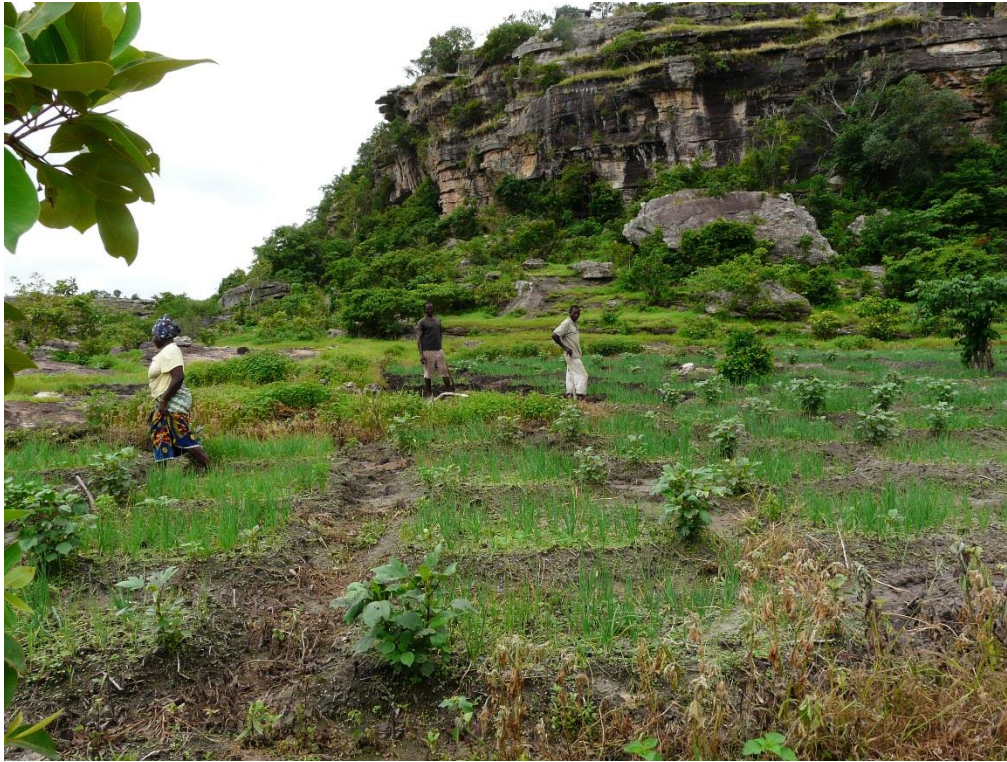
Market gardening on edge of sandstone bowl, Mt Gangan, Kindia.