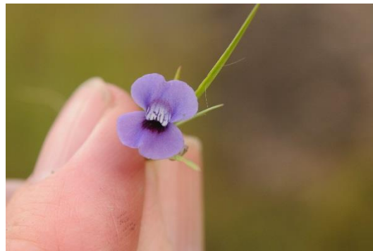
Utricularia pobeguinii Pellegr.