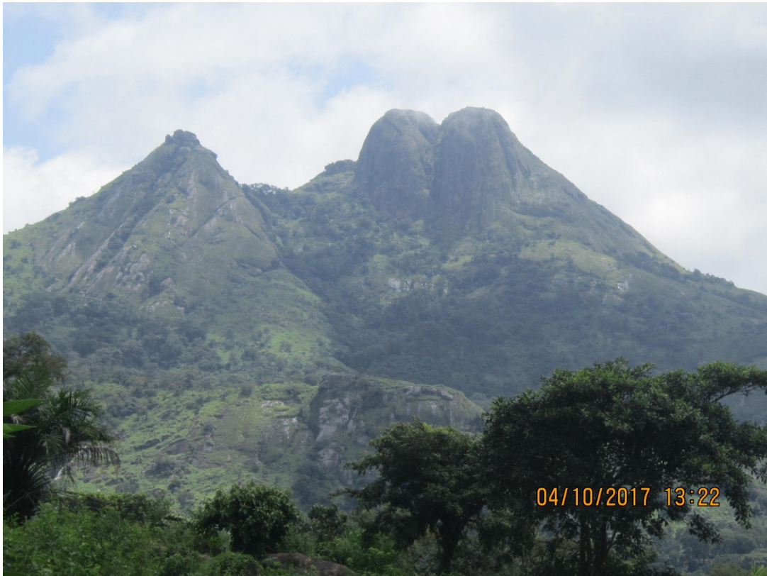
Mt Konossou