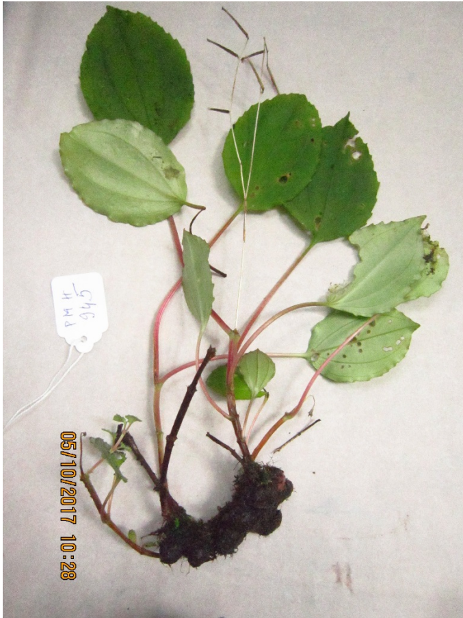
Feliciadamia stenocarpa .