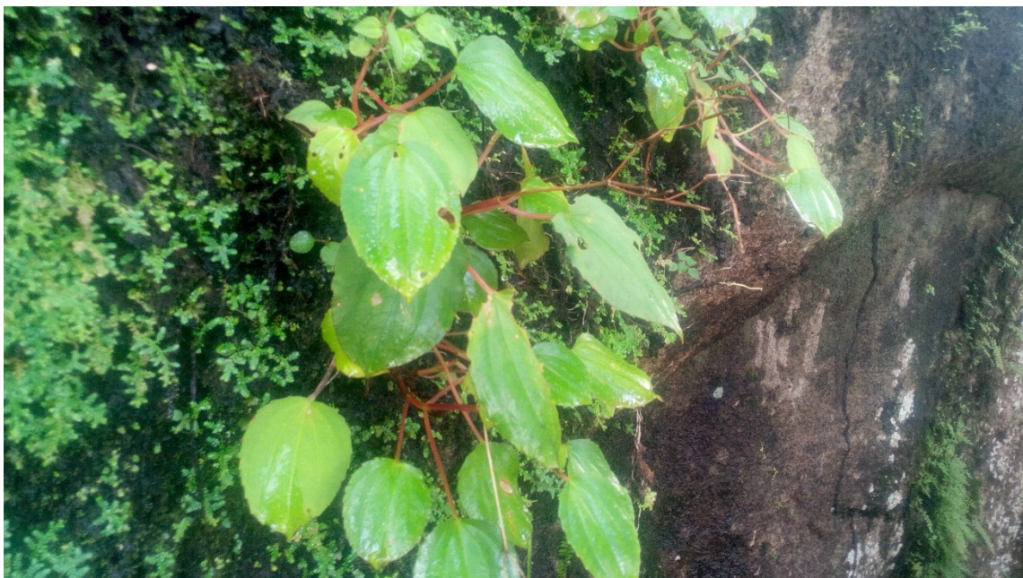
Feliciadamia stenocarpa on humid granite rocks, Mt Konossou.