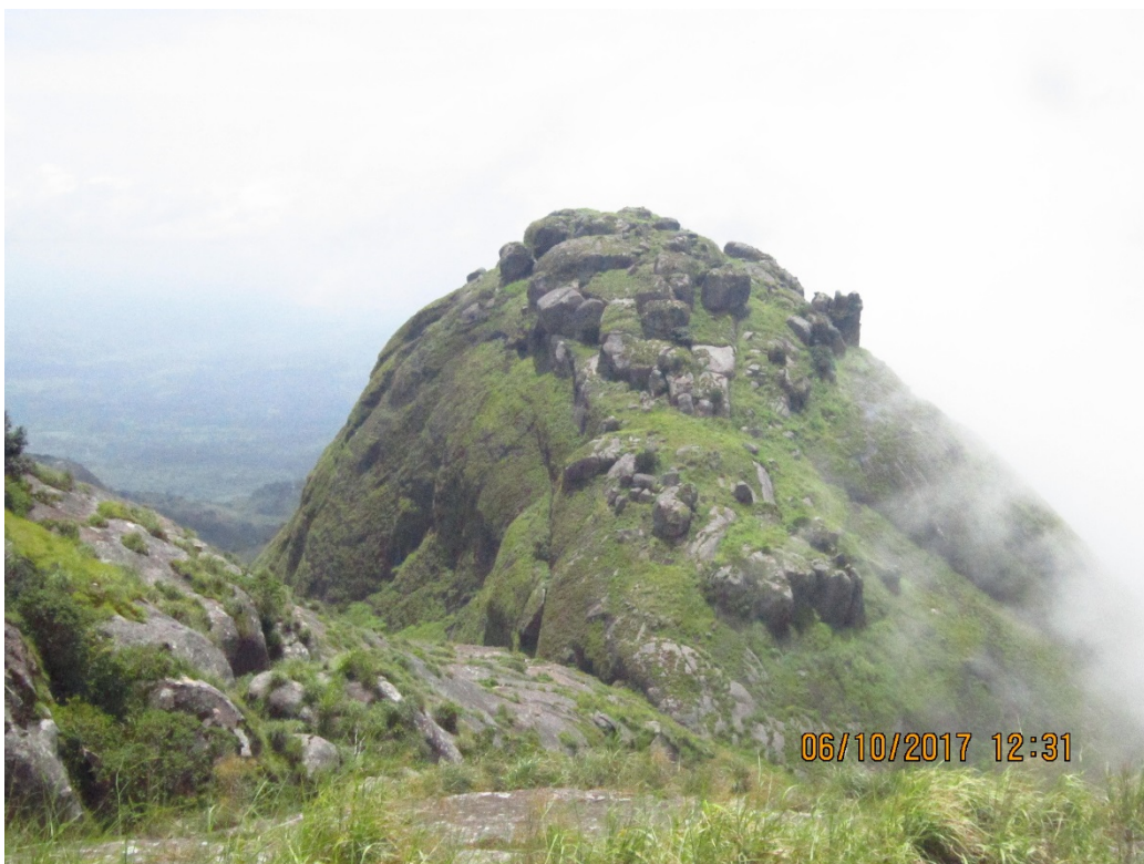
Mt Konossou peak