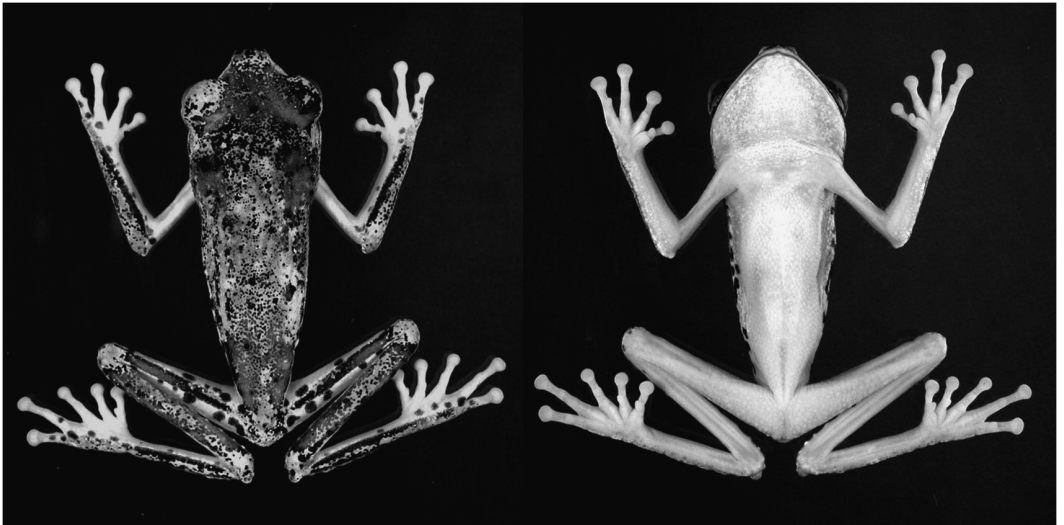
Figure 1. Phasmahyla spectabilis sp. nov., holotype (MNRJ 34650, SVL 42.6 mm), dorsal and ventral views.

Comparisons with other species. — Phasmahyla spectabilis is distinguished from P. guttata by the forearms slender in males (robust in P. guttata ), by the calcar appendage broad at the base (narrow in P. guttata ), fingers medium sized (large in P. guttata ), moderate nuptial pad of minuscule horny asperities on the