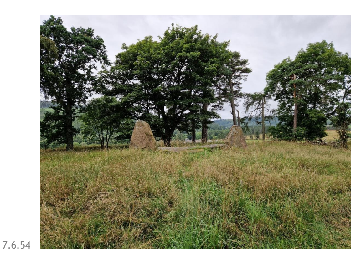
Plate 7.3: South easterly view from SM44