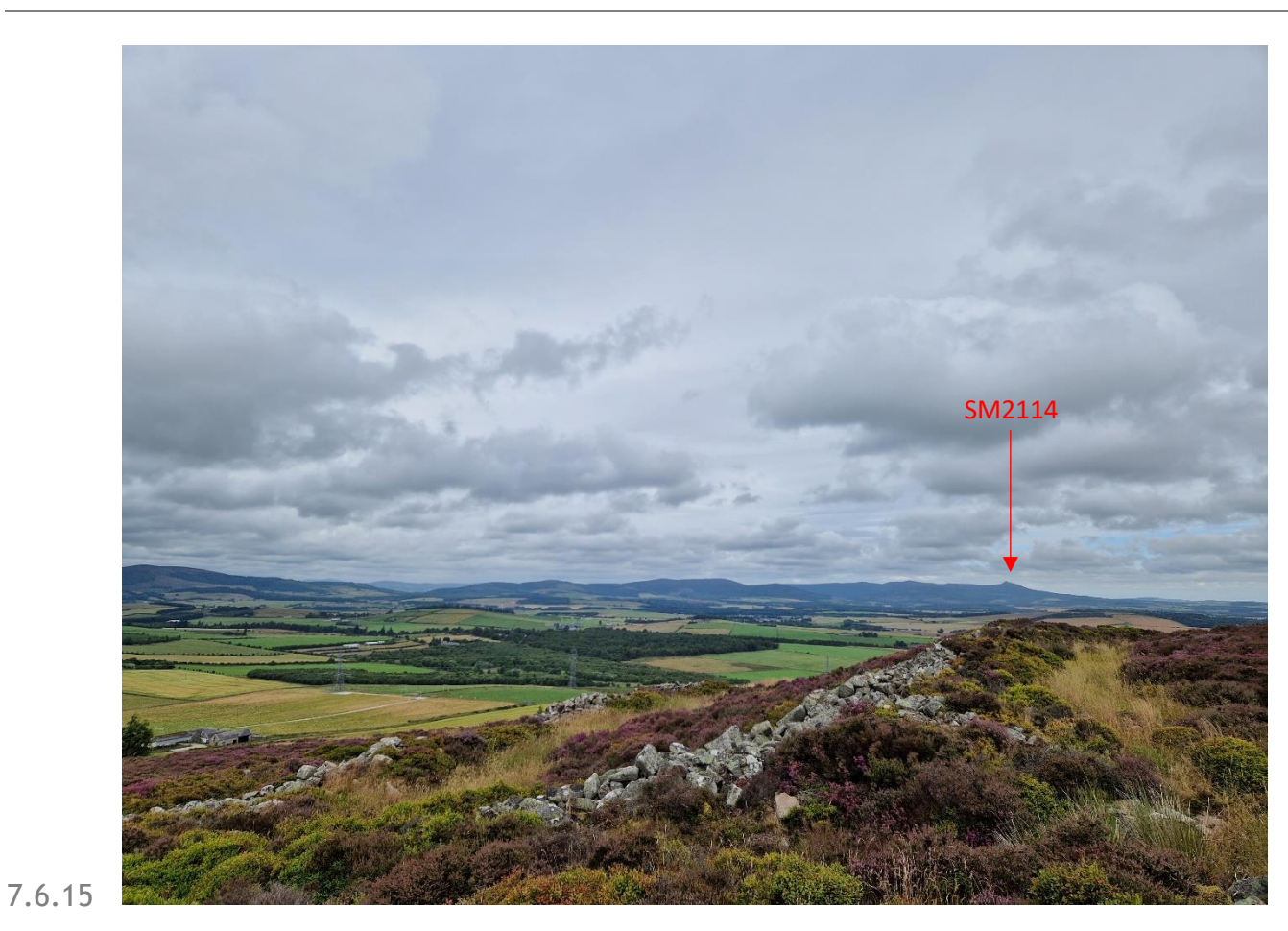
Plate 6.1: Northern Views from the South Western Entrance of Barmekin Hill Fort (SM57)

7.6.16 The asset is situated on top of a bracken and gorse covered Barmekin Hill, it overlooks the crossing of B9119 and B977 at the town of Echt as well the convergence of the A944. Also, located 1.5 km to the north of the monument lies Craigenlow Quarry (23 ha). Located 0.45 km to the monument, is 25kv overhead line which transects from the north of the asset to the west and south between the monument and Hill of Fare.