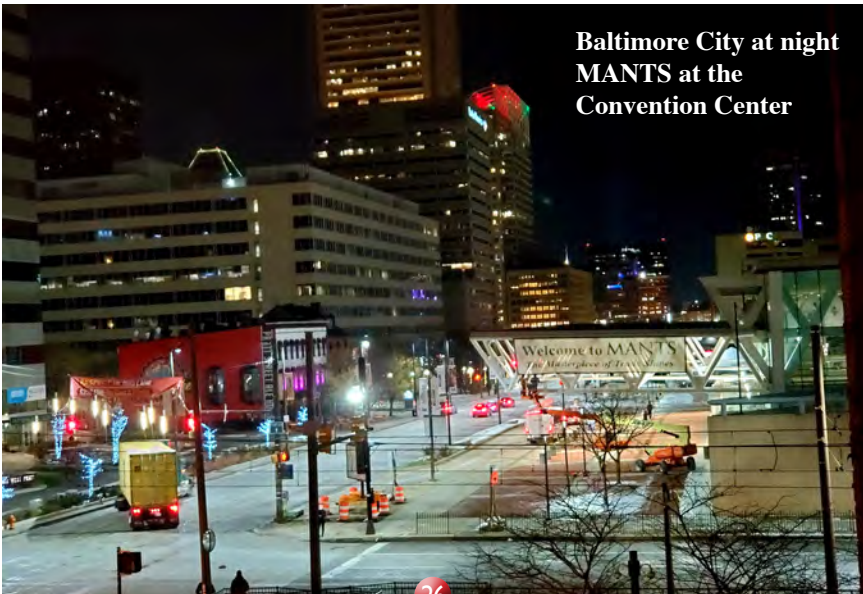
Baltimore City at night MANTS at the Convention Center

2021 reminded us that while technology has its place in our industry, there is no replacing the raw energy and enthusiasm of doing business in-person and face-to-face (even in masks). Regardless of the challenges, we were very gratified by the number of exhibiting and buying companies who participated at MANTS 2022. Whether you were able to exhibit in person or just have a presence at the show, we understand and respect that everyone had to make the decision that was best for their company”.