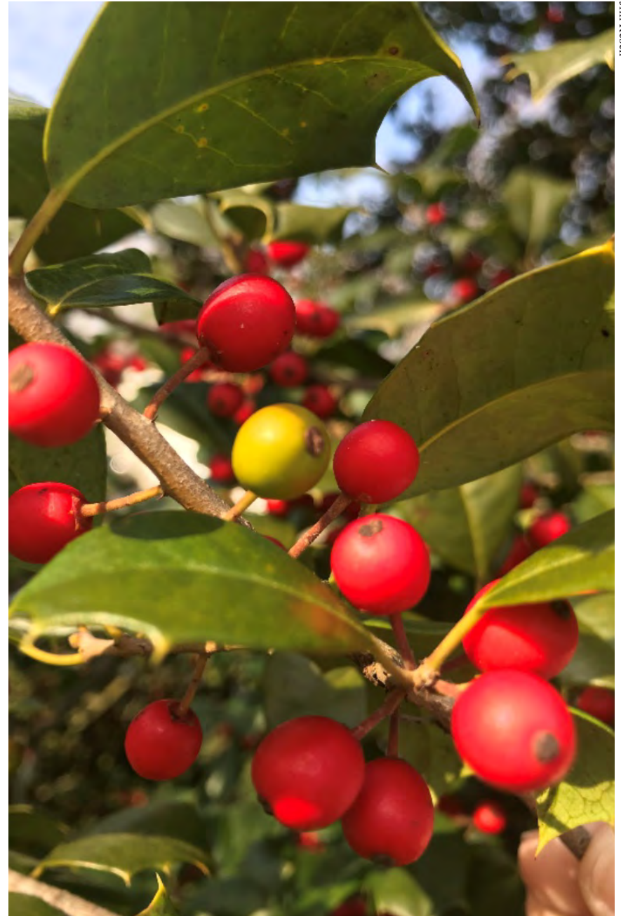
Figure 1. Ilex opaca ‘Miss Helen’ sprig showing one fruit with holly berry midge.

Holly growers will be relieved to learn that any damage to the tree appears to be purely cosmetic, limited to an occasional all-green fruit. Not all American hollies are equally susceptible, however, and in extreme cases entire crops of berries may be affected on a single tree. Named holly selections, often chosen for their abundant fruit displays, are generally fairly resistant to the holly berry