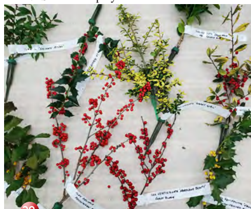
MANTS 2022 Display table