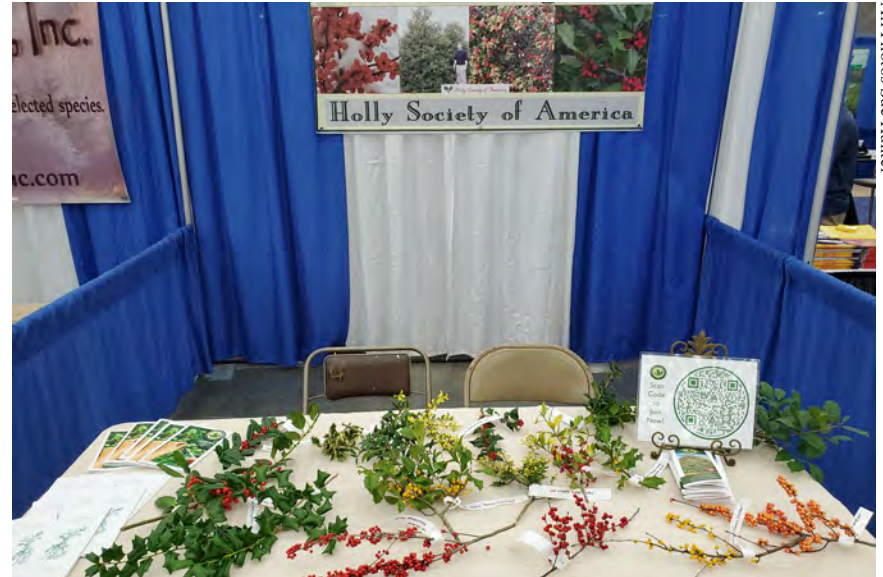
Above and below HSA MANTS 2022 Display.