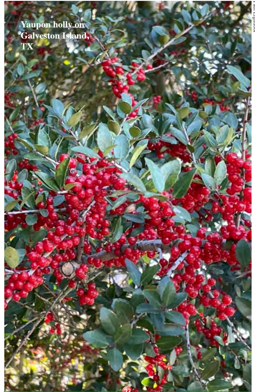
Yaupon holly on Galveston Island, TX