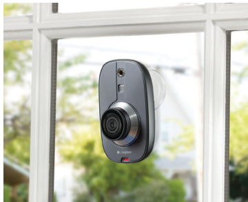
On a window looking in