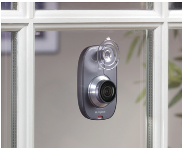
On a window looking out