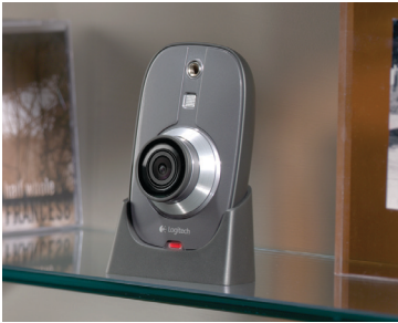
On a desk or table

Place your camera almost anywhere using the included desktop stand, wall mount, or suction cup—attached to a window, pointed inside or out.