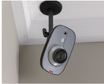
On a ceiling