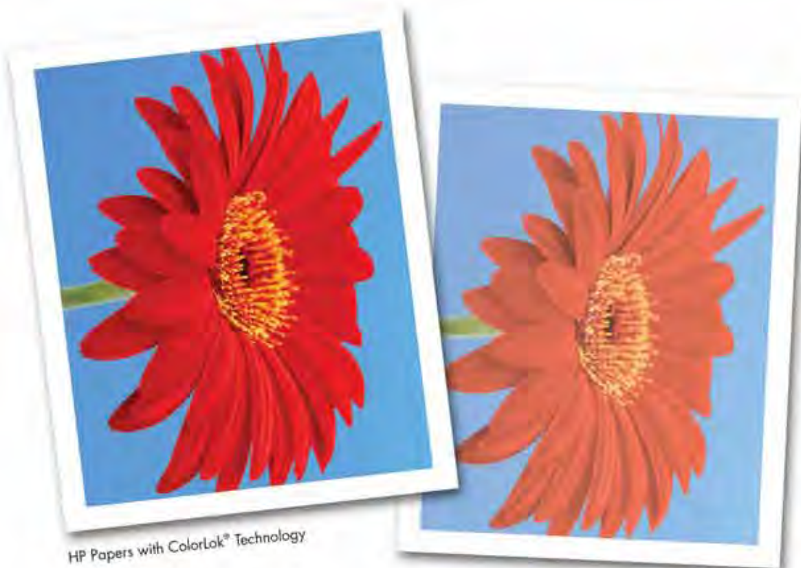
HP Papers with ColorLok® Technology