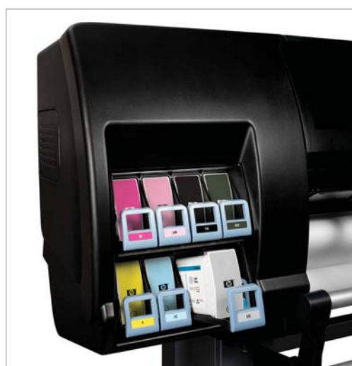
HP Vivera inks on the Z6100.

Working with a 42-inch Z6100PS unit, we found the HP setup and installation documentation top rate. In less than three hours the unit went from crate to full operation. Out of the box the Z6100 includes an automatic cutter, spindle, printheads, eight 775ml ink cartridges, a maintenance cartridge and kit, a 25-foot sample roll of HP Heavy-weight Coated Paper, the stand and basket, a