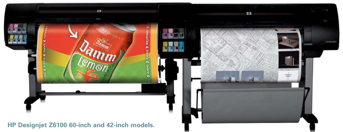
HP Designjet Z6100 60-inch and 42-inch models.

The printers use HP's advanced Vivera pigment 775ml ink cartridges—cyan, light cyan, magenta, light magenta, yellow, light gray, matte black, and photo black. HP says these inks resist fading in or near a window for more than one year unlaminated, more than three years laminated, and 200-plus years away from direct sunlight.