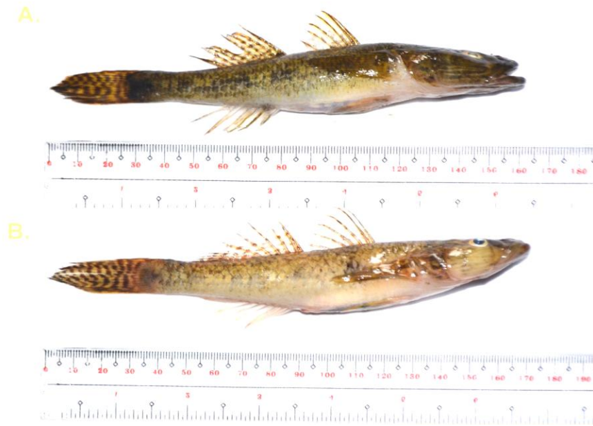
Figure 2: (A) Glossogobius celebius and (B) Glossogobius giuris species