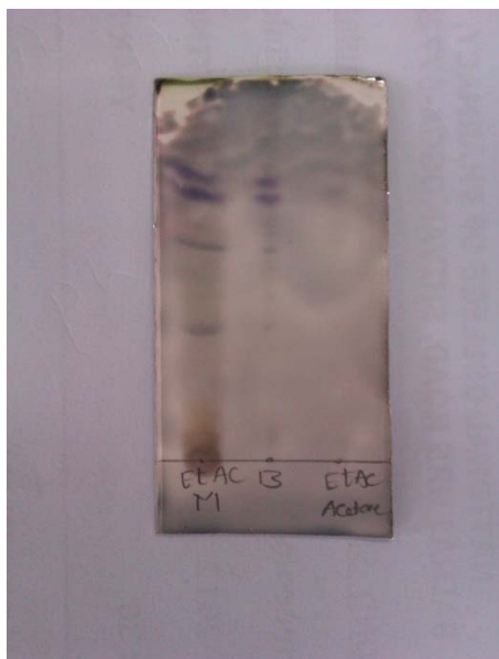
Figure No: 1: Photograph showing the TLC of ethyl acetate fraction from methanol, benzene extract and acetone extract